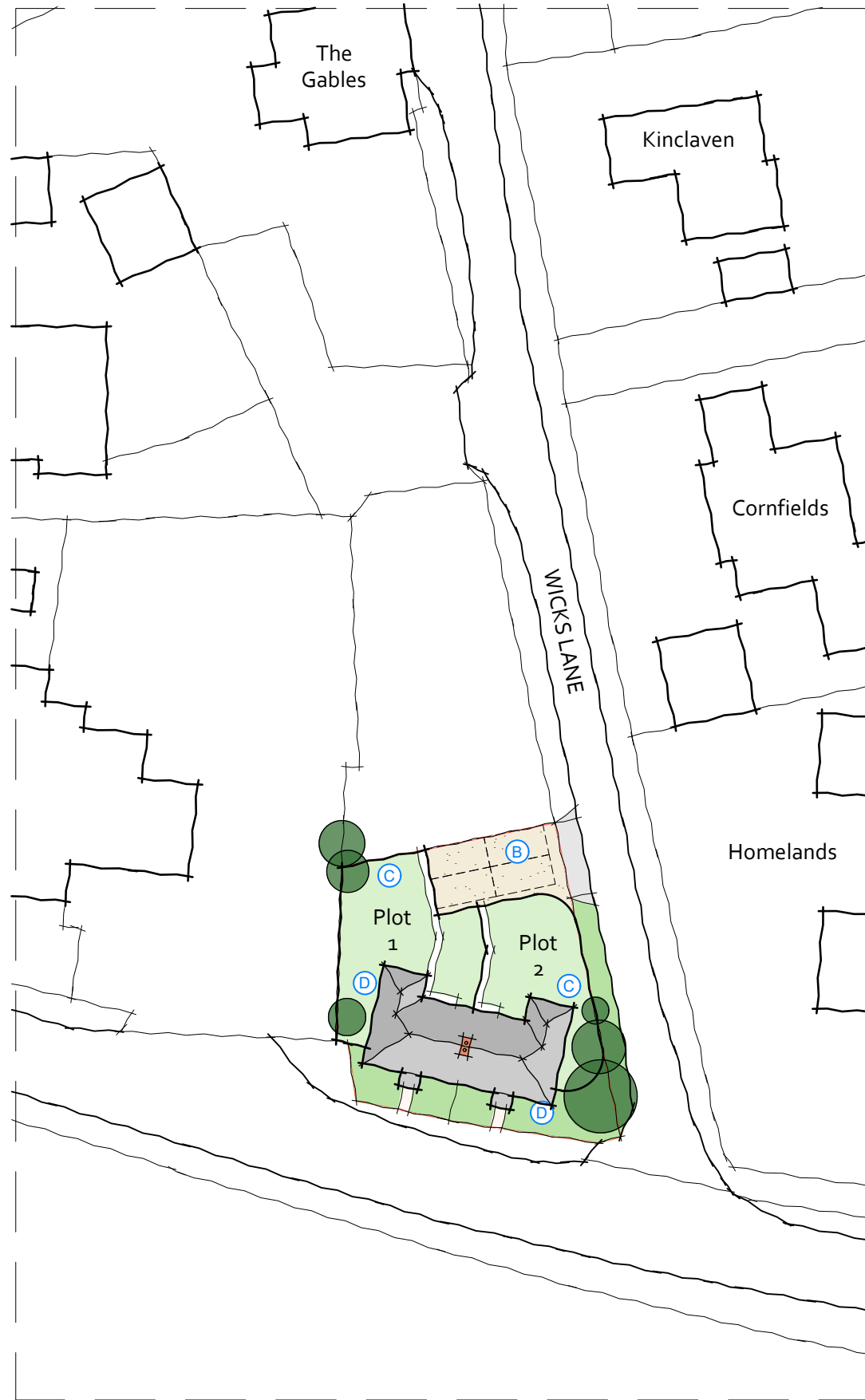
Block Plan as Proposed