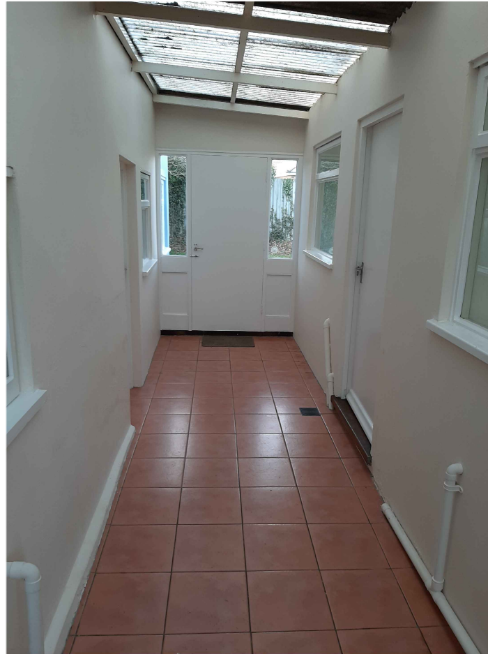
Internal photo Lobby