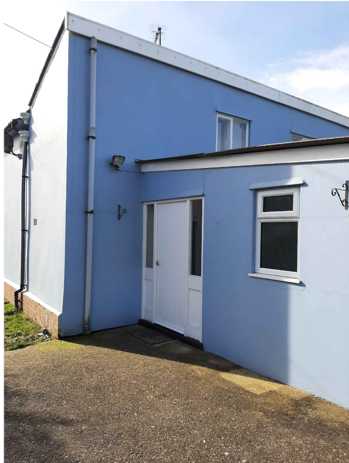
External photo From Wicks Lane