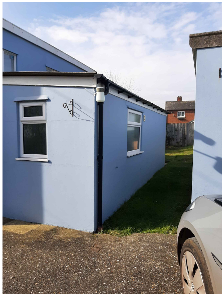
External photo From Wicks Lane