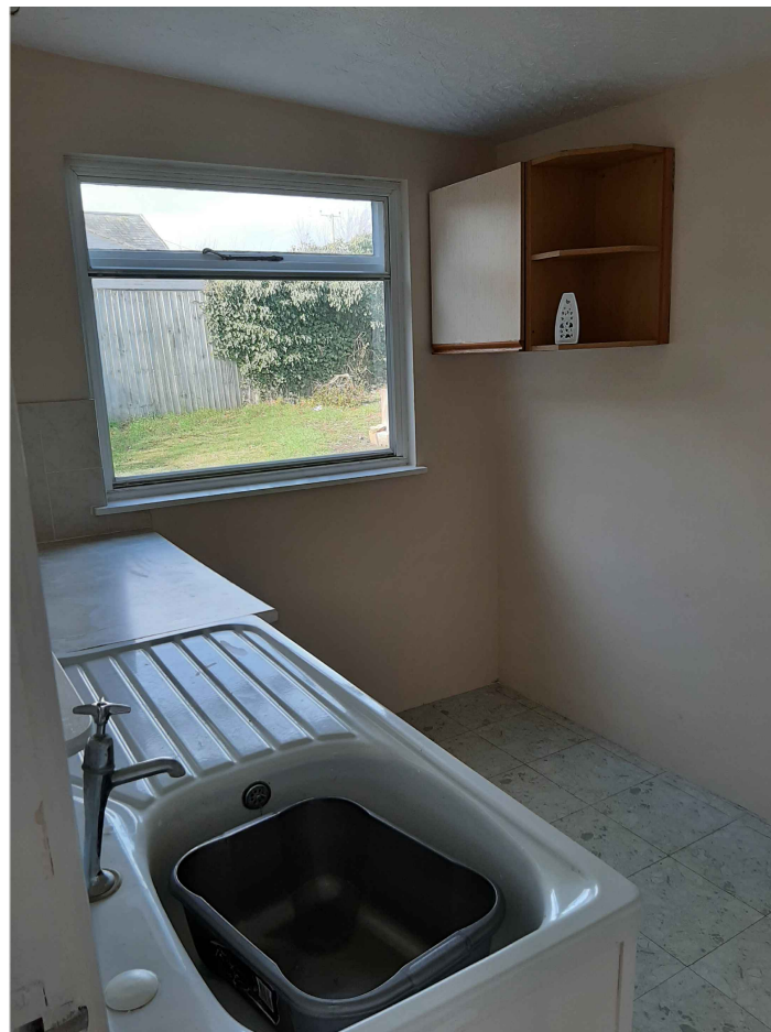
Internal photo Utility Room