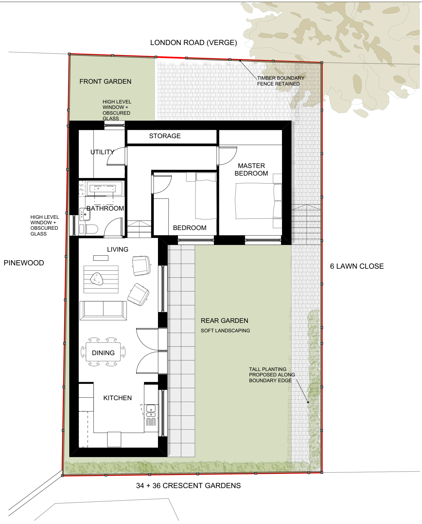
2. GENERAL ARRANGEMENT PLAN PROPOSED