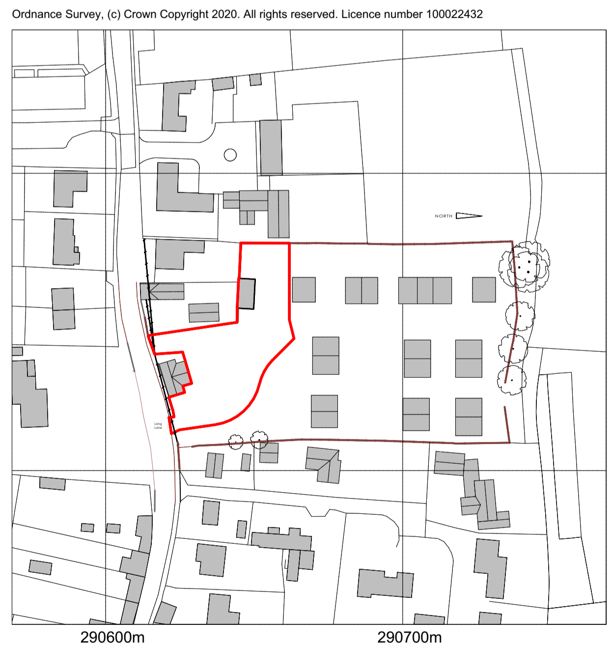
Site Location Plan 1:1250