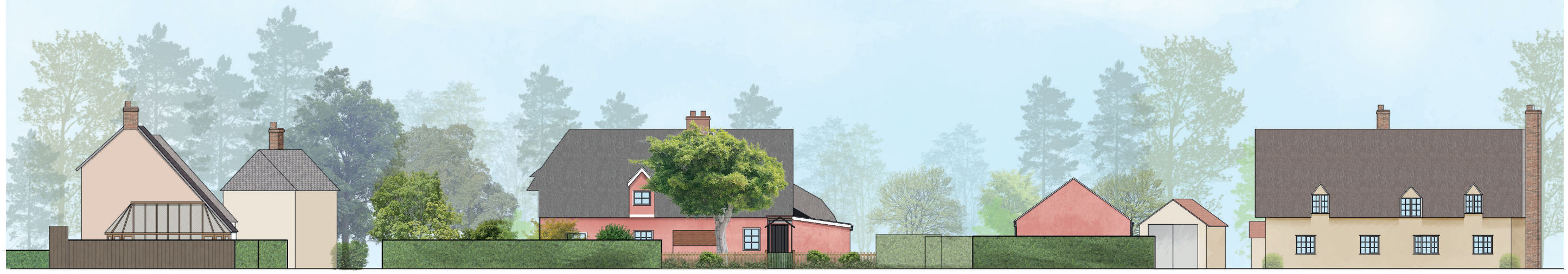
1 1:100 @ A1, 1:200 @ A3 EXISTING BALLS HILL ELEVATION