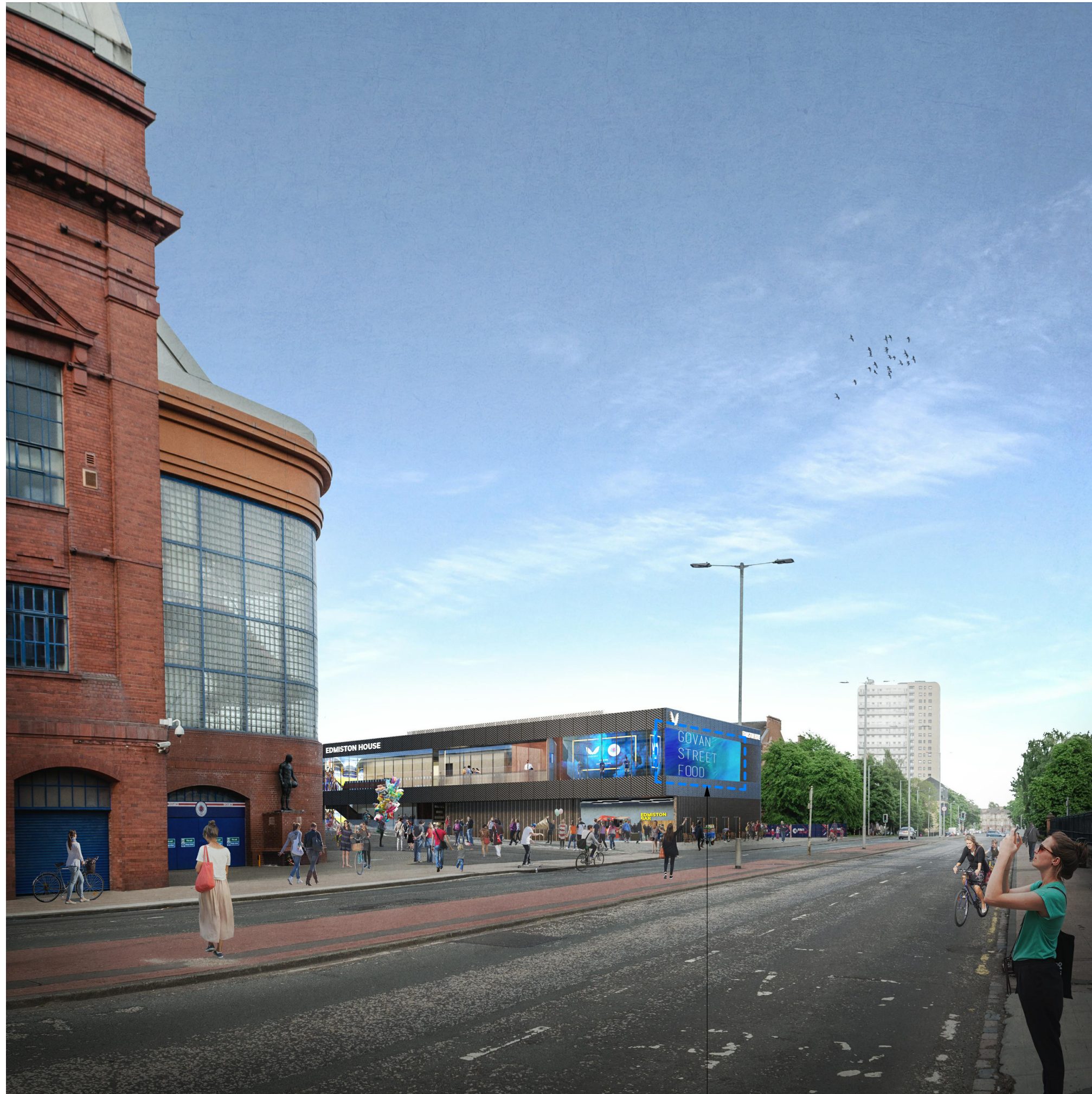
Proposed Media Display Wall submitted for Planning Consent. All other external signage to be submitted for approval separately.

CDM: Hazard Elimination & Risk Reduction has been undertaken and recorded where appropriate, in accordance with the requirements of "The Construction (Design and Management) Regulations 2015" and the associated "Industry Guidance for Designers"