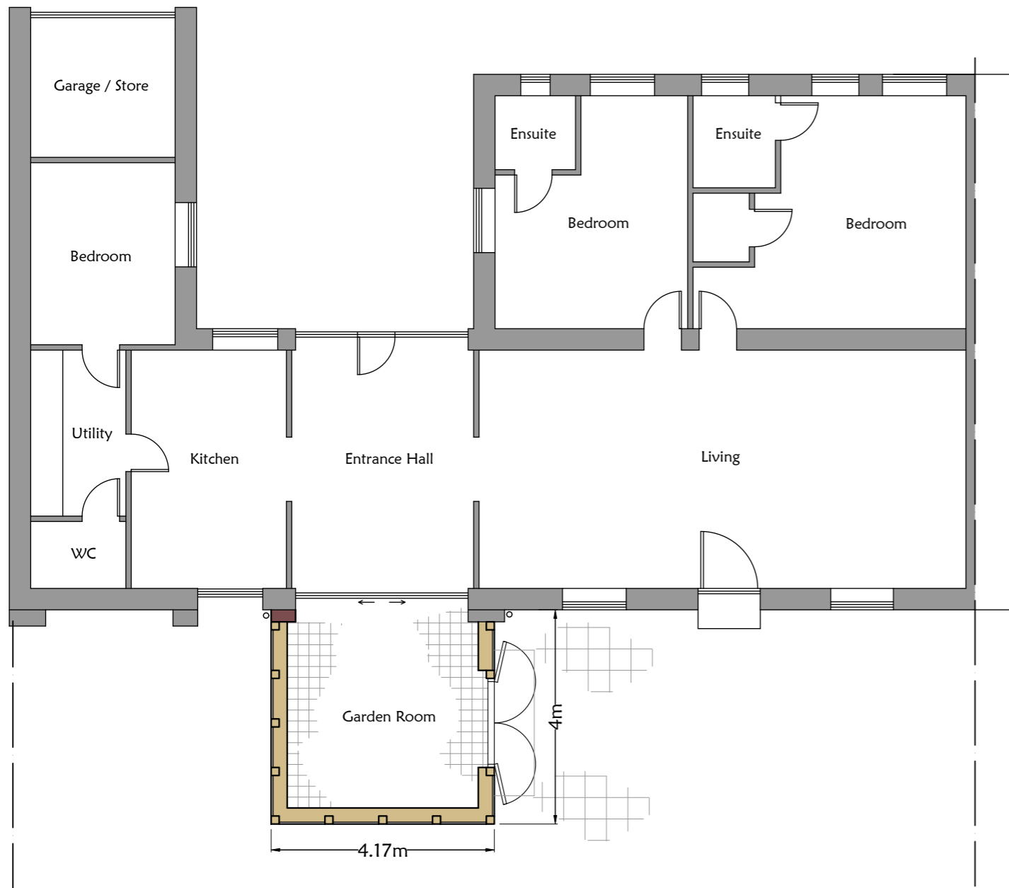
Proposed Plan 1:100