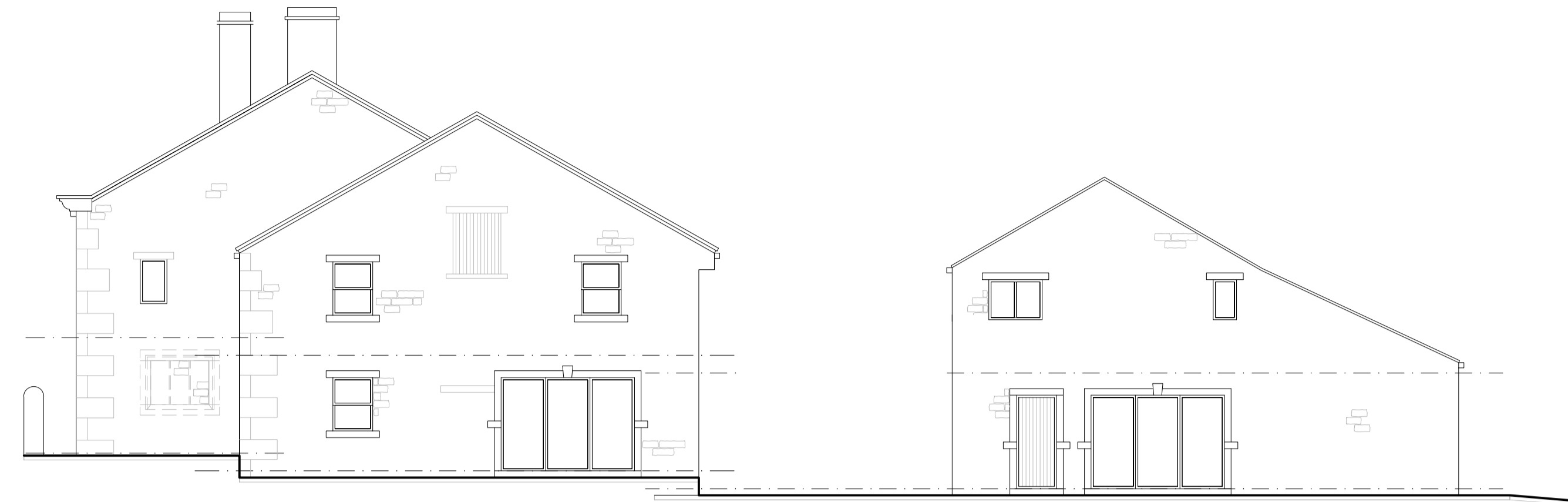
PROPOSED ELEVATION Side (NE) 1:100@A1