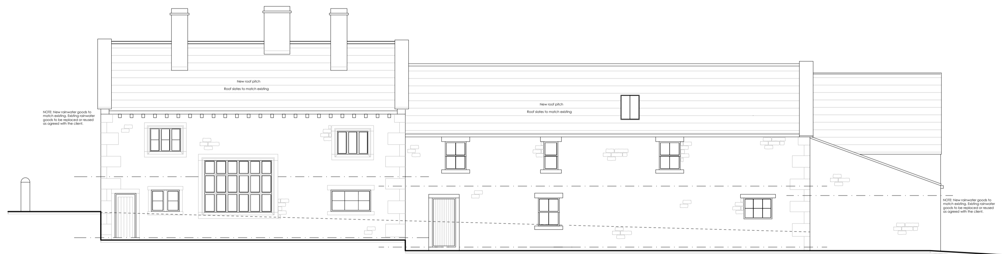
PROPOSED ELEVATION Rear 1:100@A1