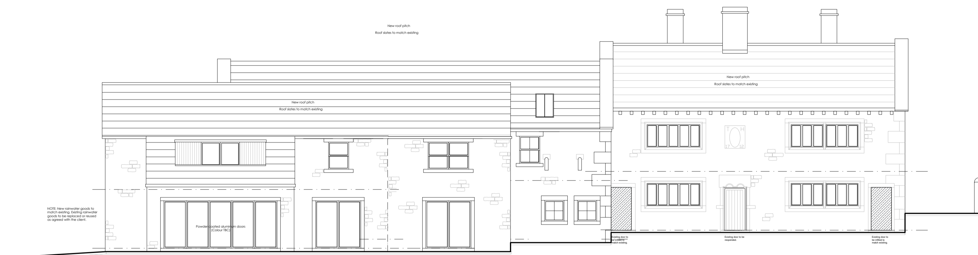
PROPOSED ELEVATION Front 1:100@A1