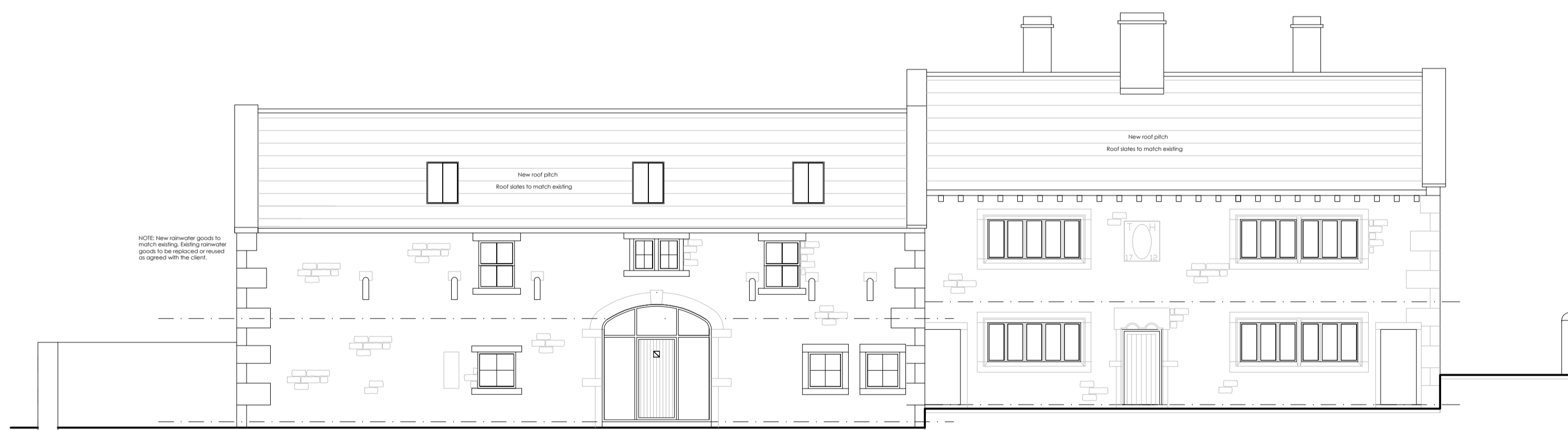
PROPOSED ELEVATION Courtyard 1:100@A1