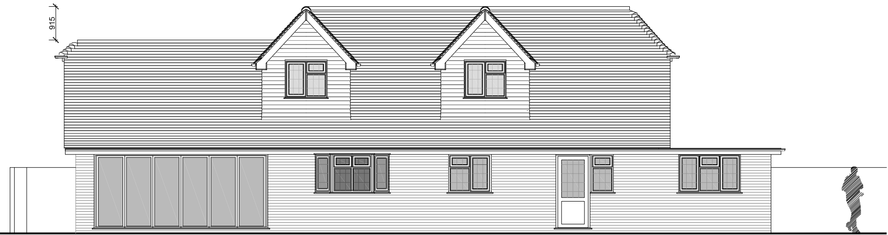
REAR ELEVATION (North East)

Loft _____ 4.920 ▽ First floor _____ 2.527 ▽ Ground floor _____ 0.000 ▽