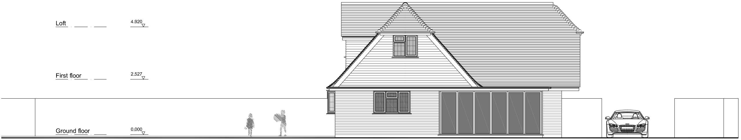
SIDE ELEVATION (North West)

Loft _____ 4.920 ▽ First floor _____ 2.527 ▽ Ground floor _____ 0.000 ▽