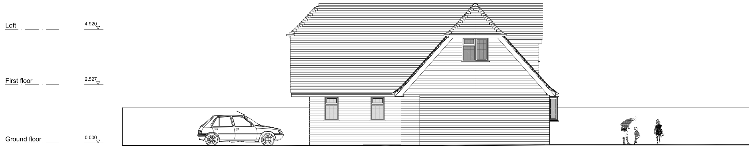
SIDE ELEVATION (South East)