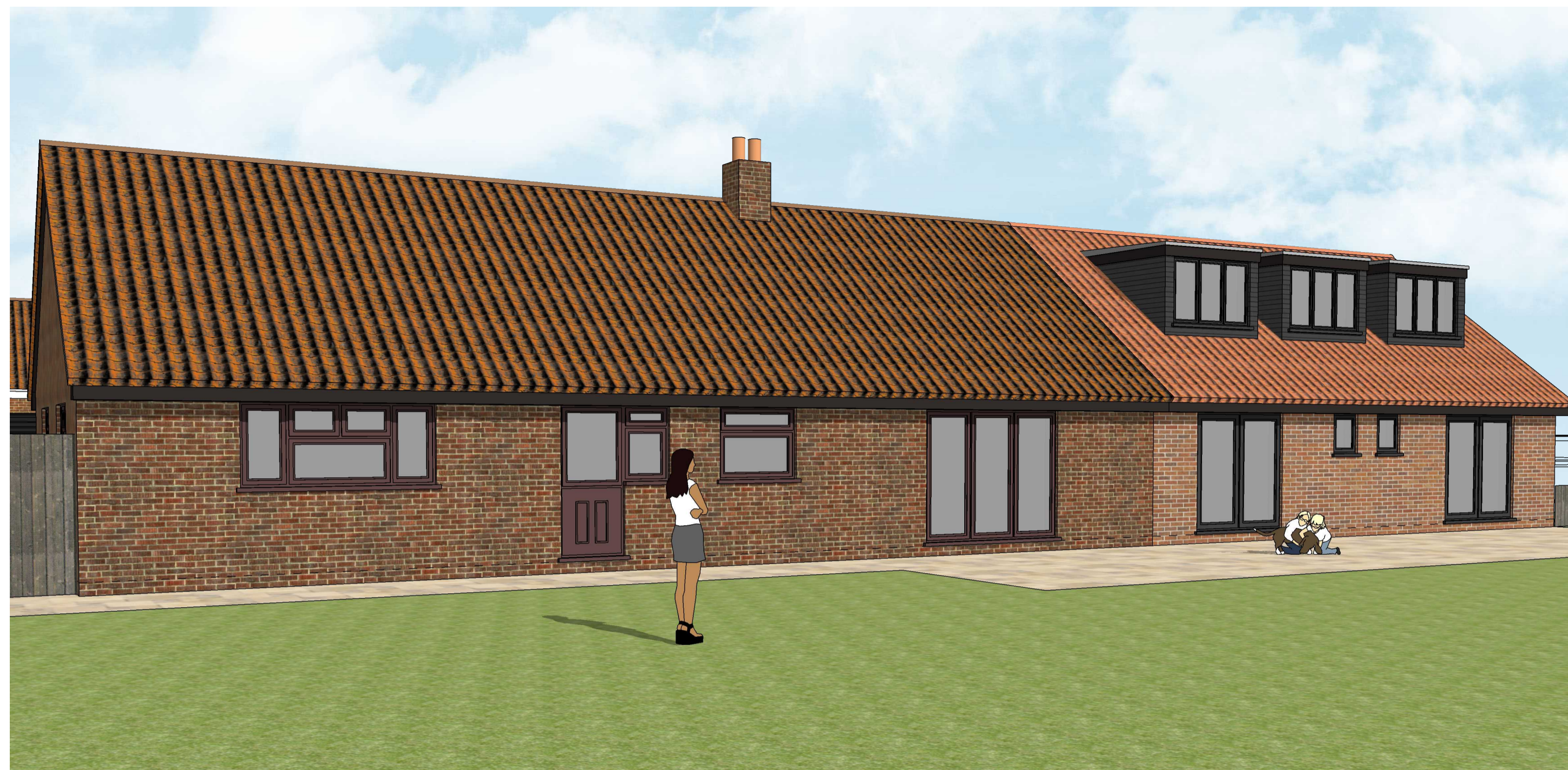
REAR PERSPECTIVE Scale NTS