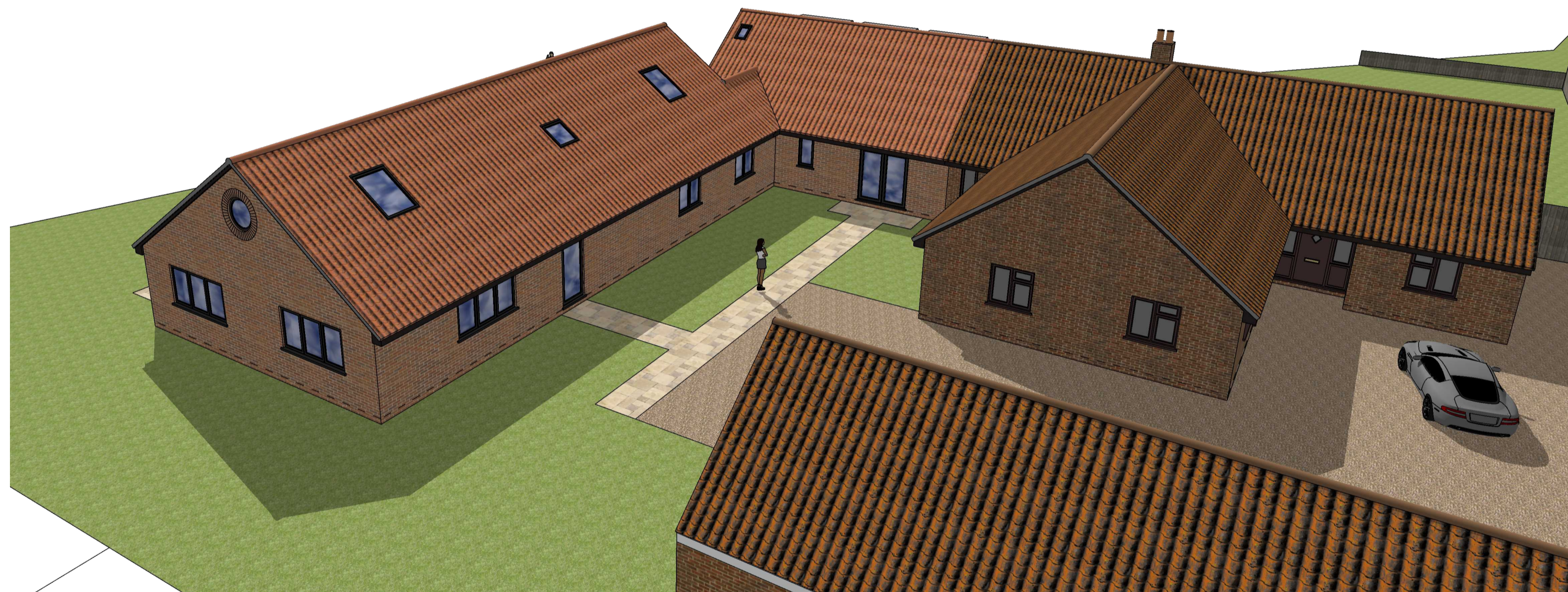
FRONT AERIAL Scale NTS