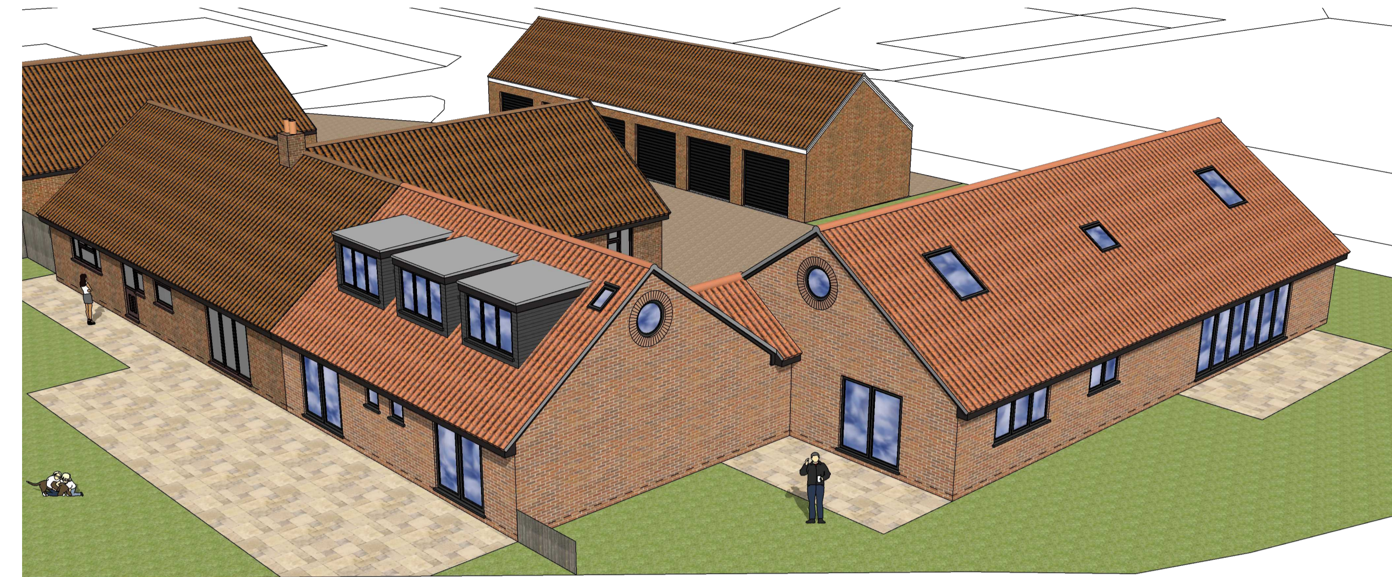
REAR AERIAL Scale NTS