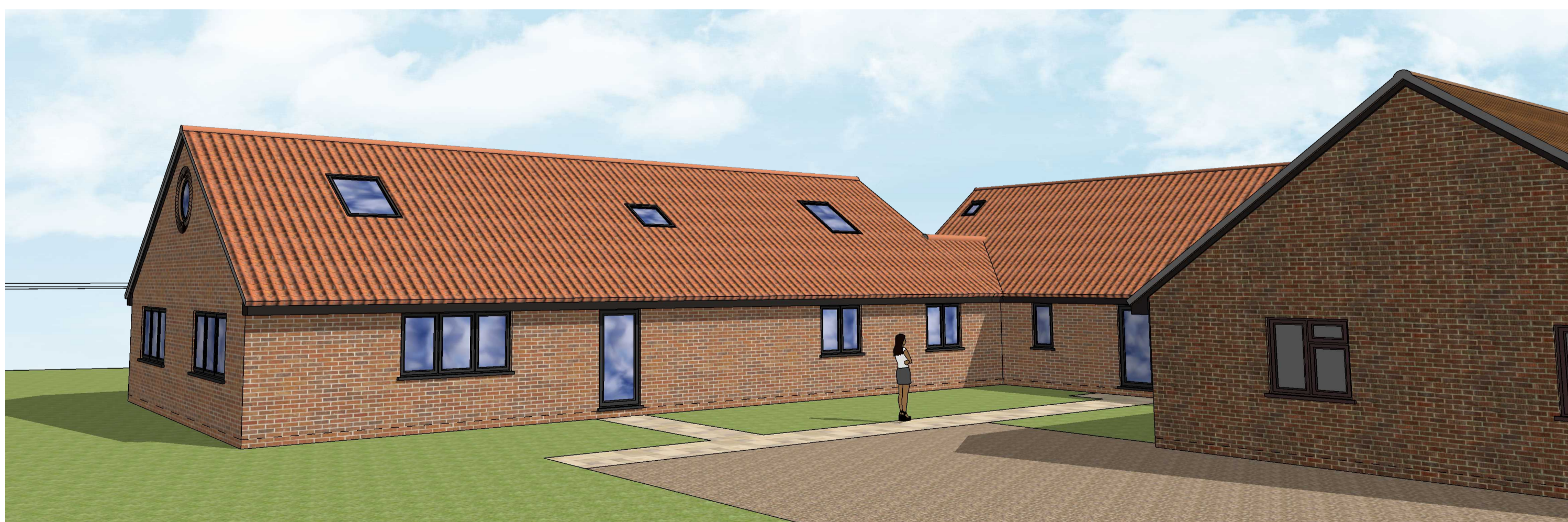
FRONT PERSPECTIVE Scale NTS