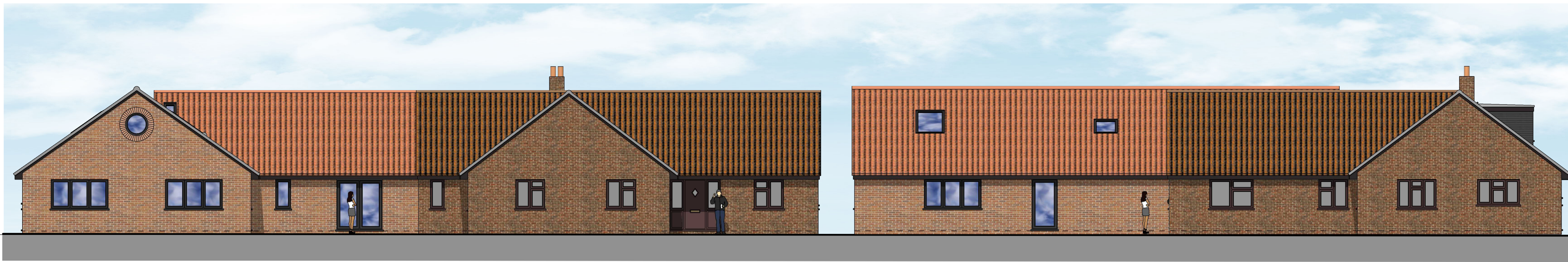
NORTH ELEVATION Scale 1:100