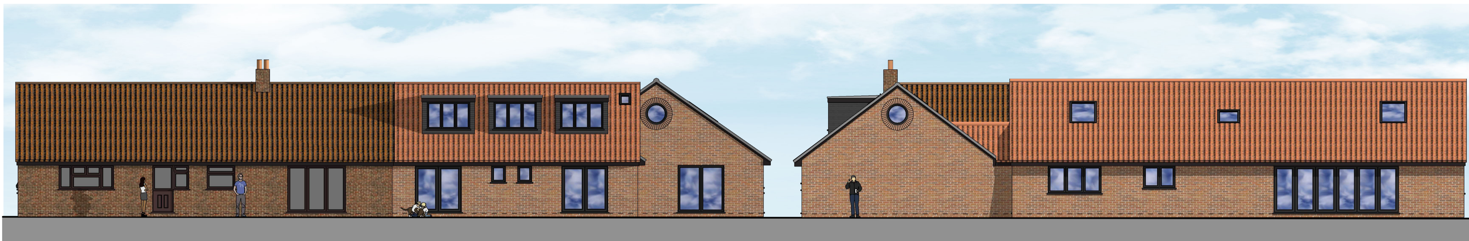
SOUTH ELEVATION Scale 1:100