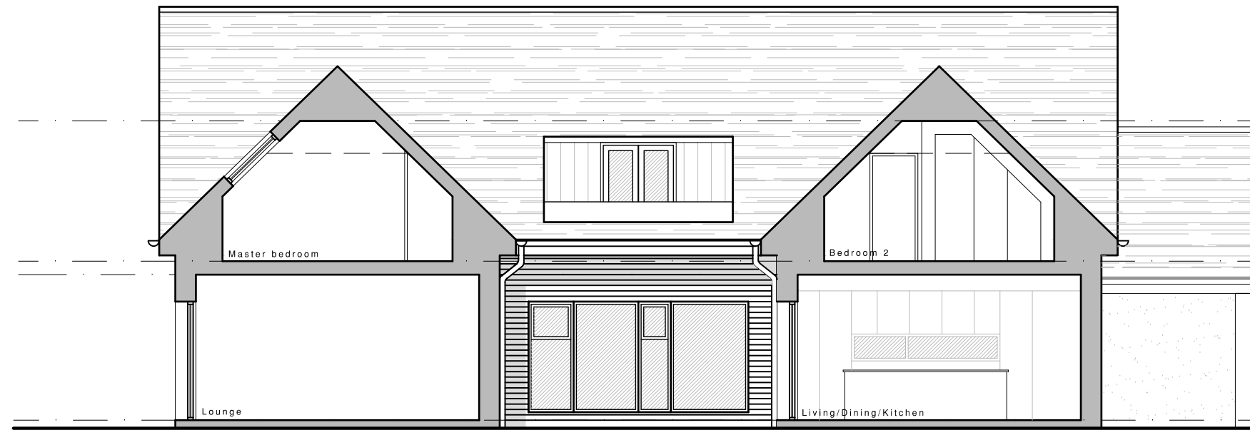
PROPOSED SECTION A-A SCALE 1/100

This drawing, its contents and all information contained therein is protected by copyright. This drawing is for preliminary or planning purposes only unless specifically noted otherwise below, and does not constitute a construction issue drawing.