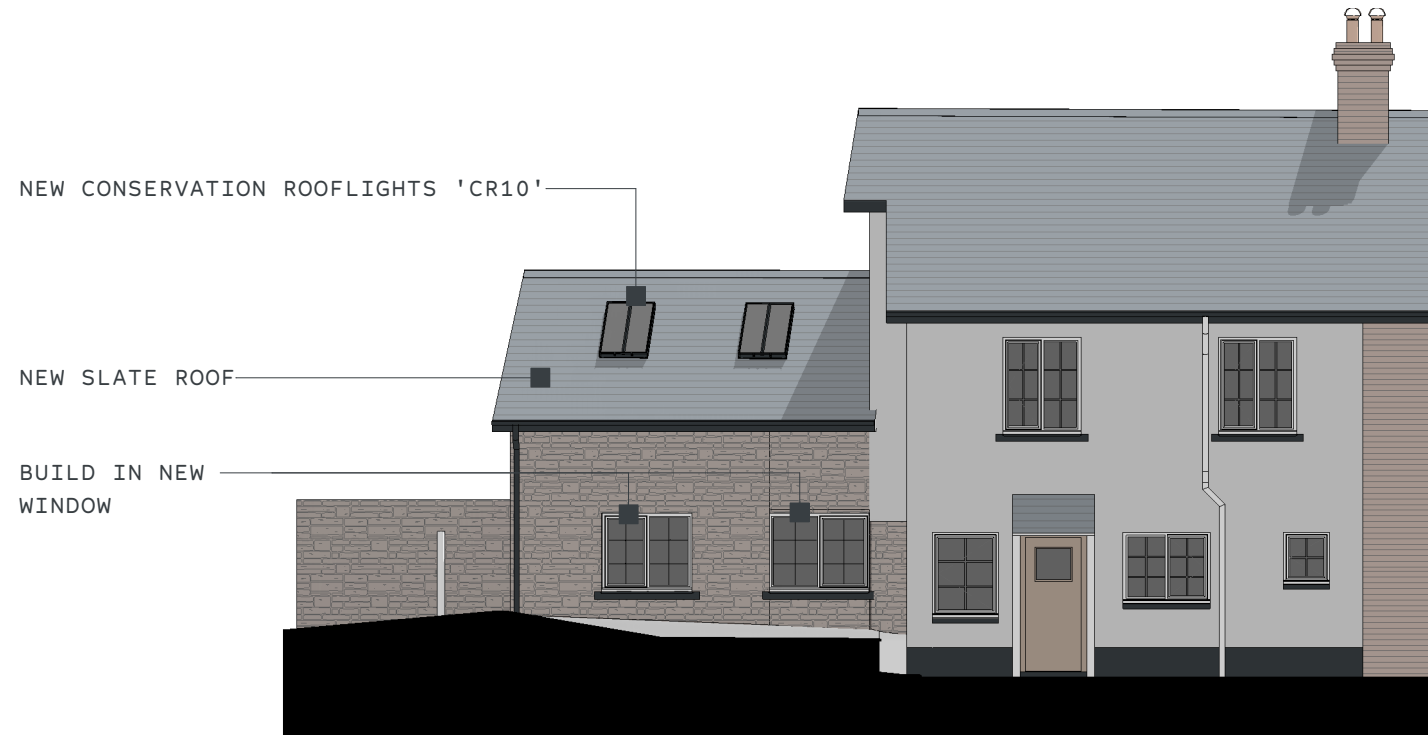
AS PROPOSED - NORTH ELEVATION 1 : 100