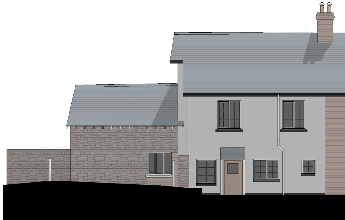
1 AS EXISTING - NORTH ELEVATION 1 : 100