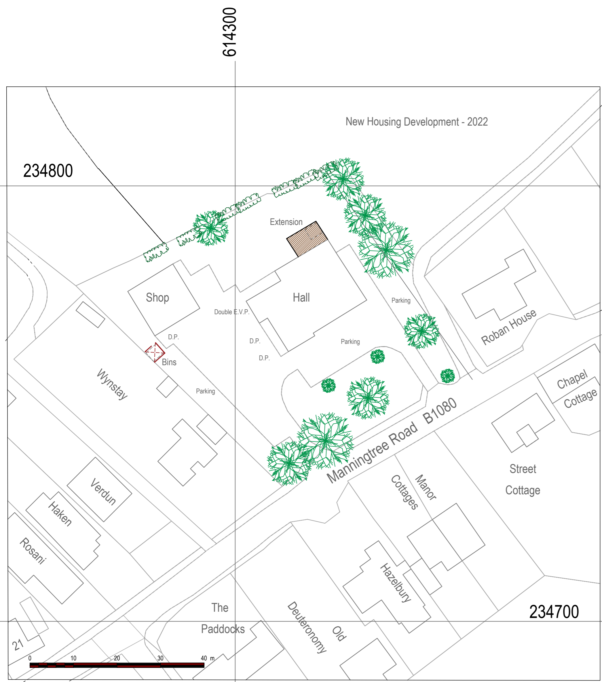
BLOCK PLAN - 1:500

This drawing is the copyright of Design Partnership and cannot be reproduced in any form without express consent of the company. Written and scaled dimensions to be checked on site, any discrepancies reported prior to work commencing.