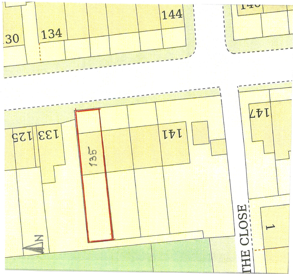
SITE LOCATION SHOWING EXISTING DROPPED KERBS SCALE 1:200