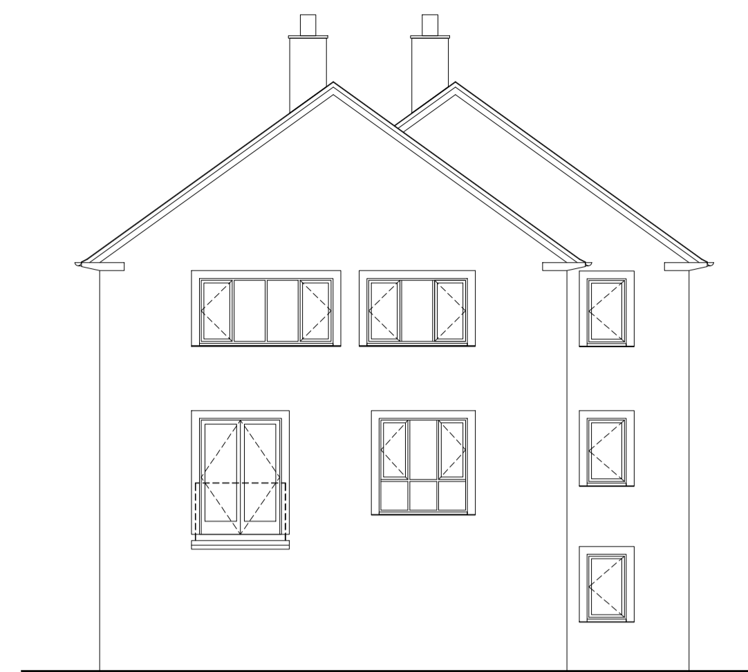
ELEVATION 2 (EAST)