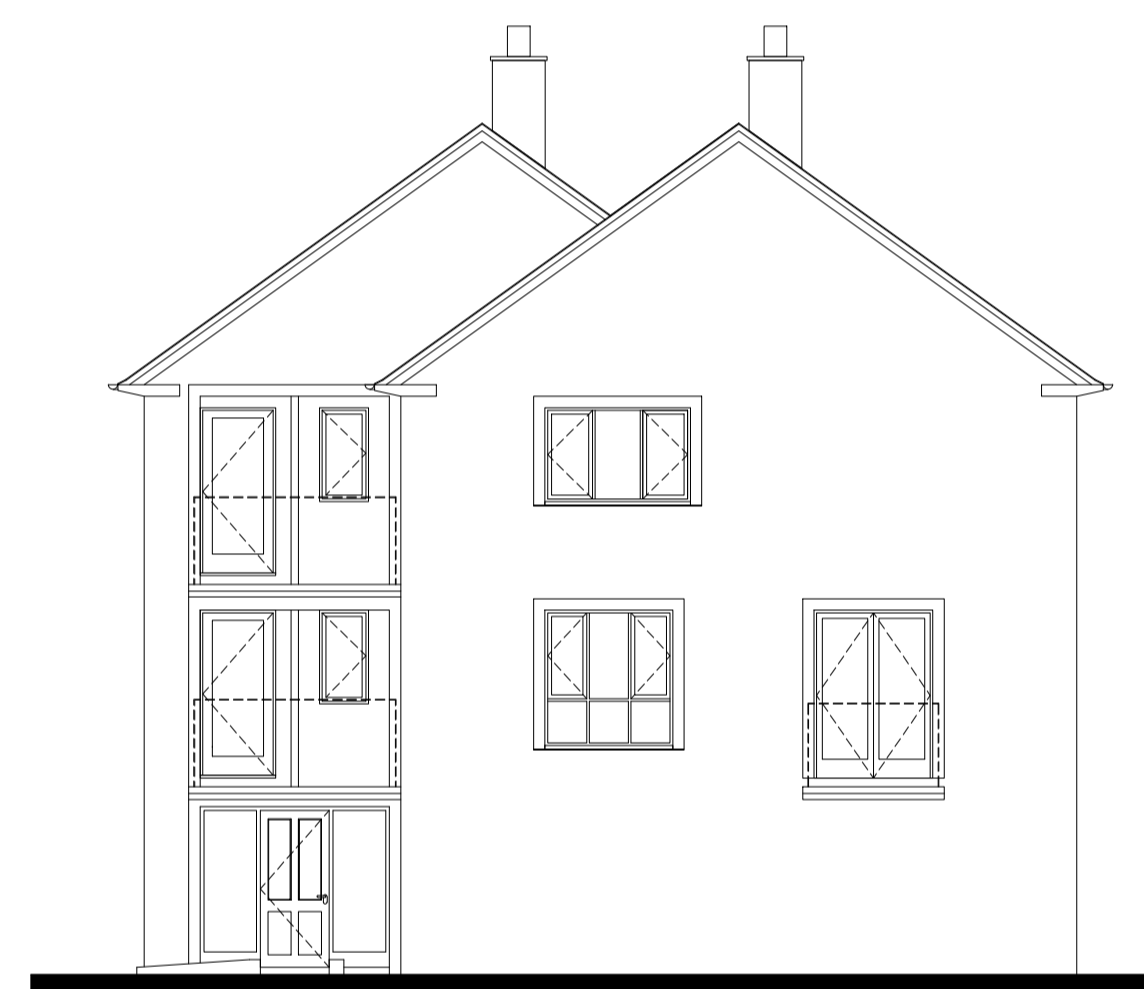
ELEVATION 4 (WEST)