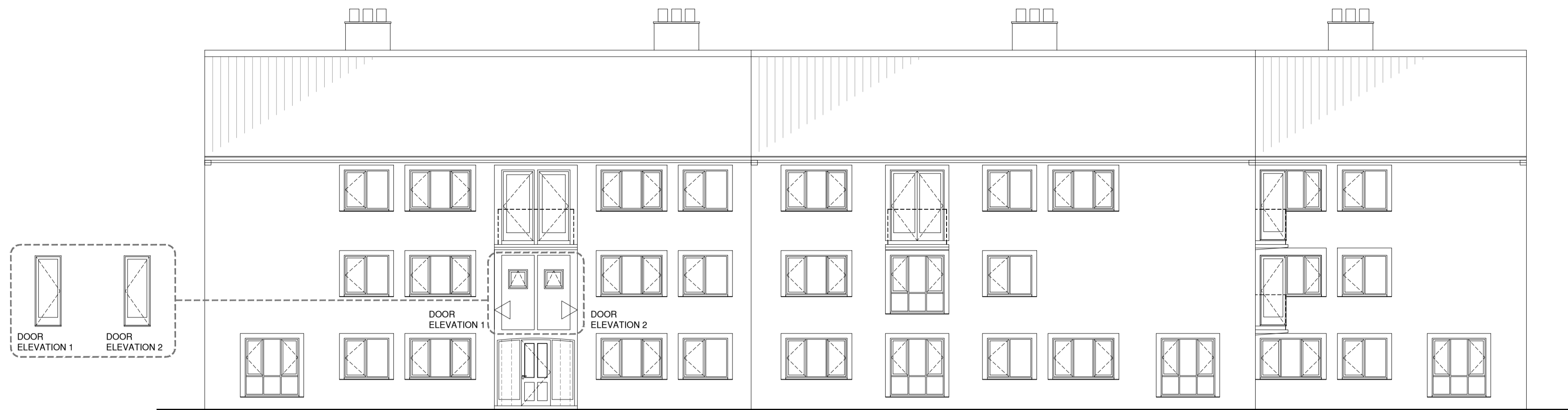
ELEVATION 1 (NORTH)

NOTES Do not scale from this drawing. Only figured dimensions are to be taken from this drawing. Contractor must verify all dimensions on site before commencing any work or shop drawings. Report any discrepancies to the architect before commencing work. If this drawing exceeds the quantities taken in any way the architects are to be informed before the work is initiated. Work within the Construction (Design & Management) Regulations 2015 is not to start until Pre Construction Health and Safety Information has been produced by the Principal Designer and a Principal Contractor has produced a Construction Phase Health and Safety Plan. This drawing is copyright and must not be reproduced without consent of BSB Architecture This drawing originates from the CAD file: S:\2021\21825_Lime Tree Avenue, York\010_BSB Drawings\1020_Current Issue\025_Appraisal\21825_BSB_00_XX_M2_A_0003_0004 Existing And Proposed Elevations.dwg REVISIONS Rev Description Dwn Date Chk Date