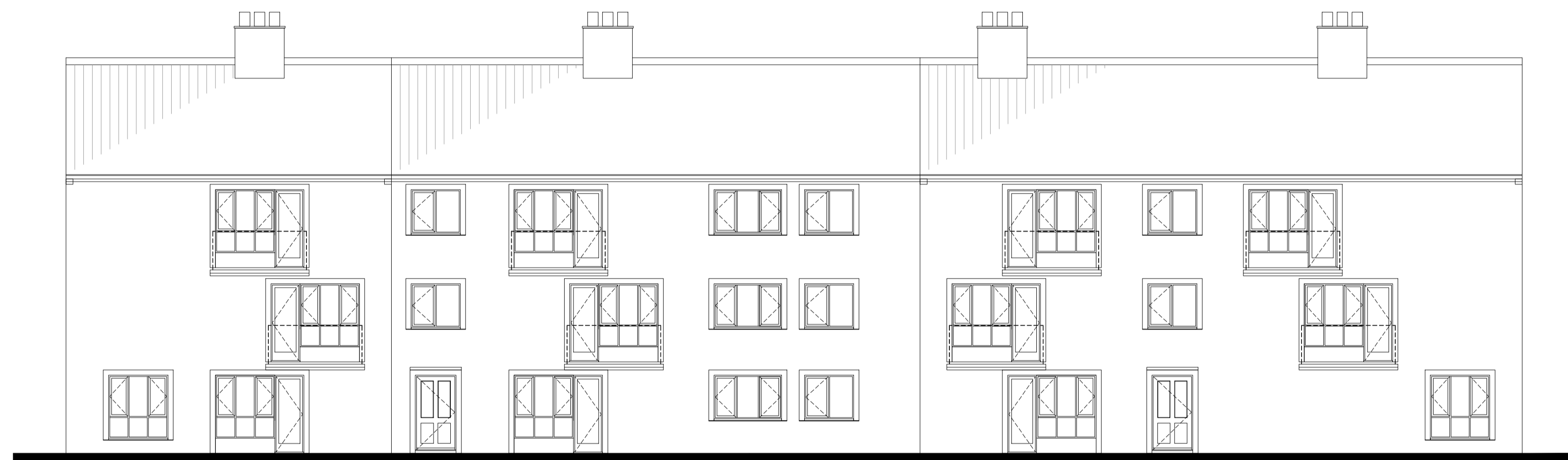
ELEVATION 3 (SOUTH)