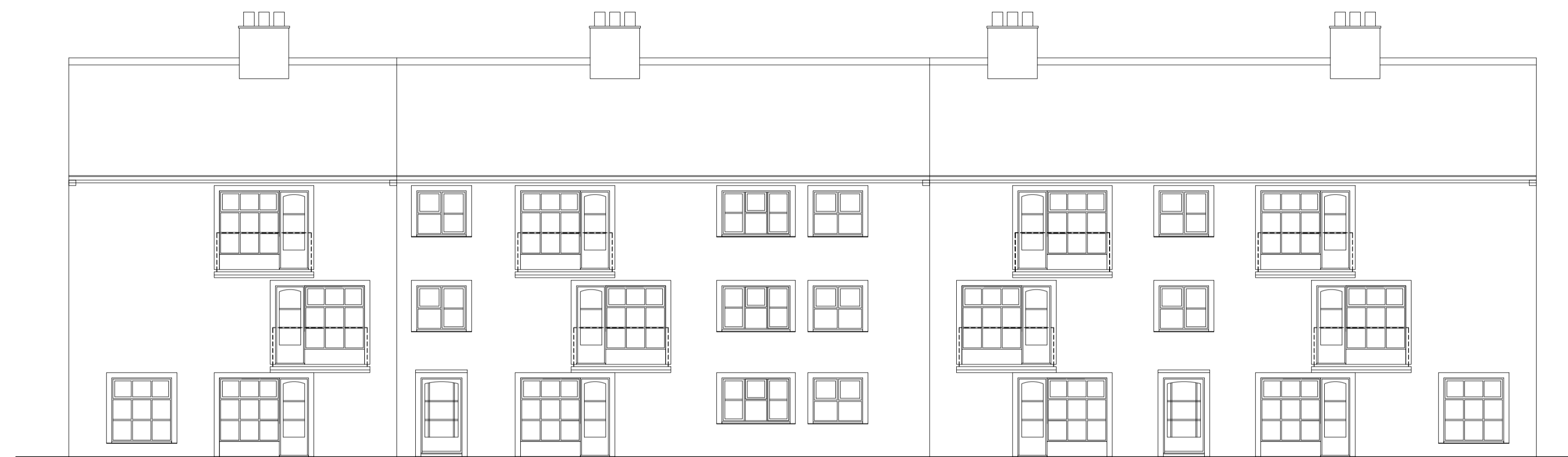
ELEVATION 3 (SOUTH)