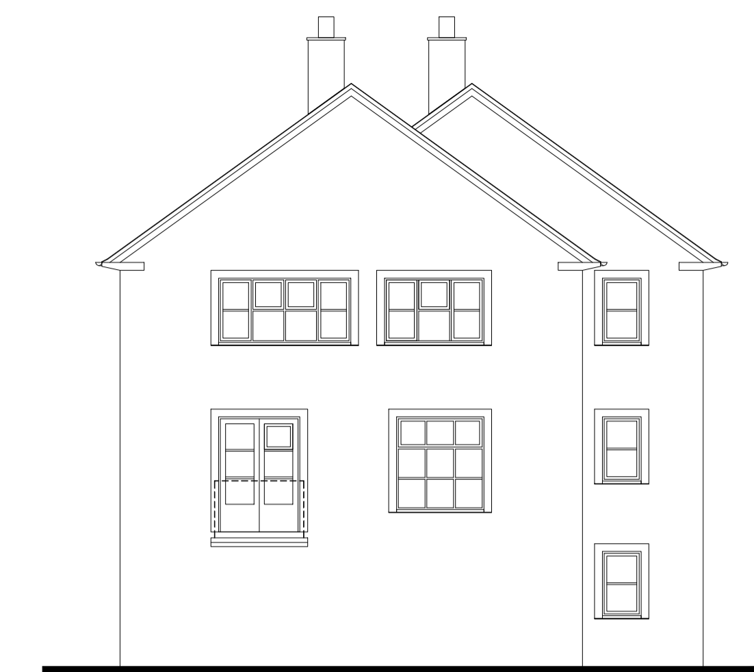
ELEVATION 2 (EAST)