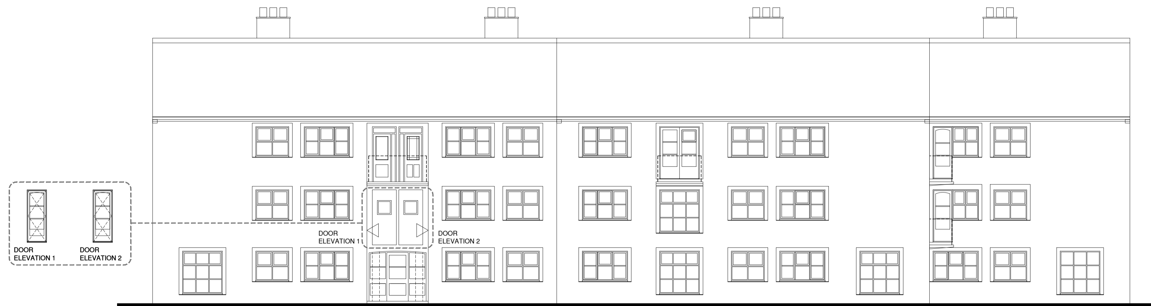
ELEVATION 1 (NORTH)