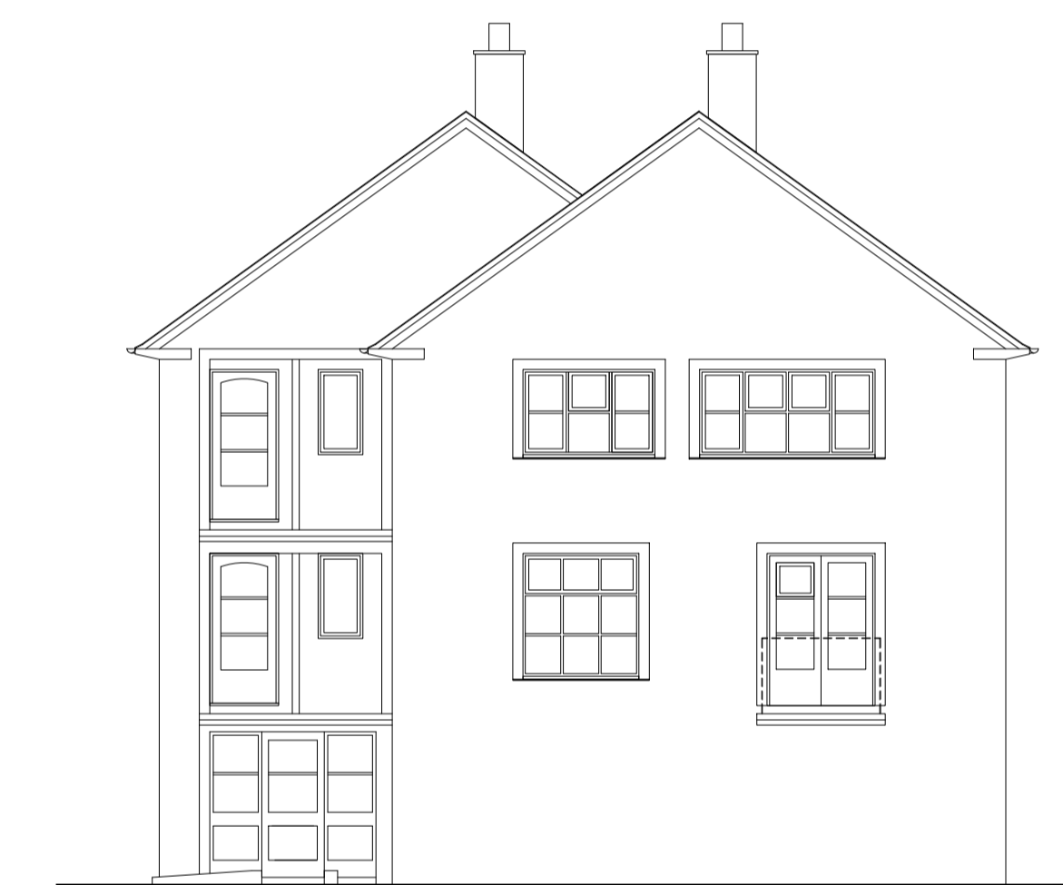
ELEVATION 4 (WEST)