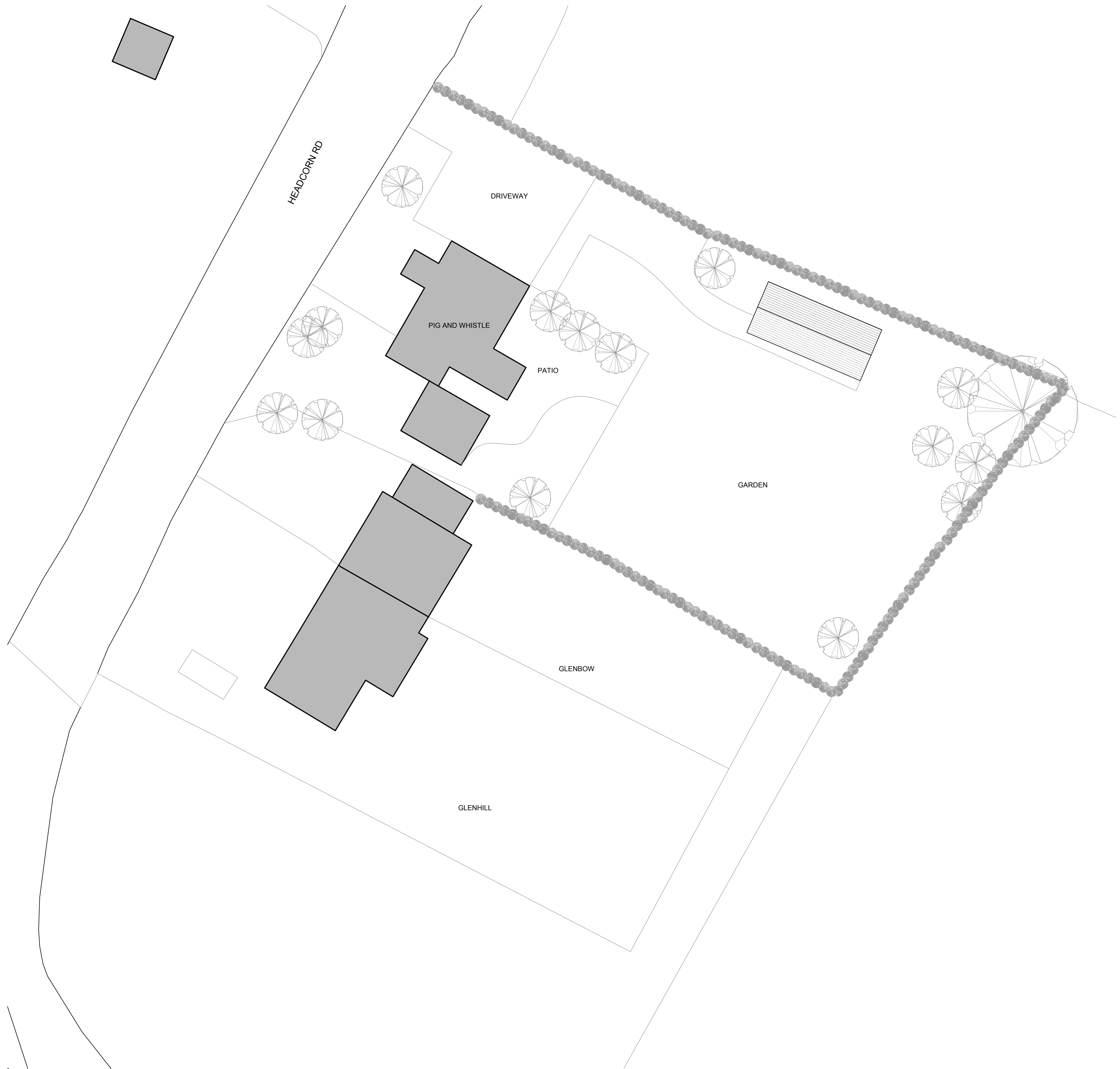
Existing Block Plan Scale 1:200