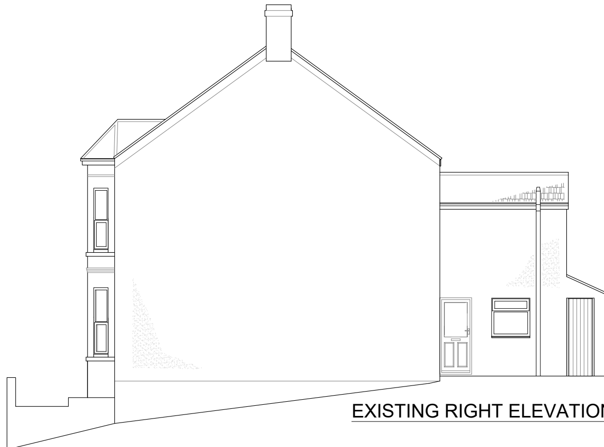
EXISTING RIGHT ELEVATION