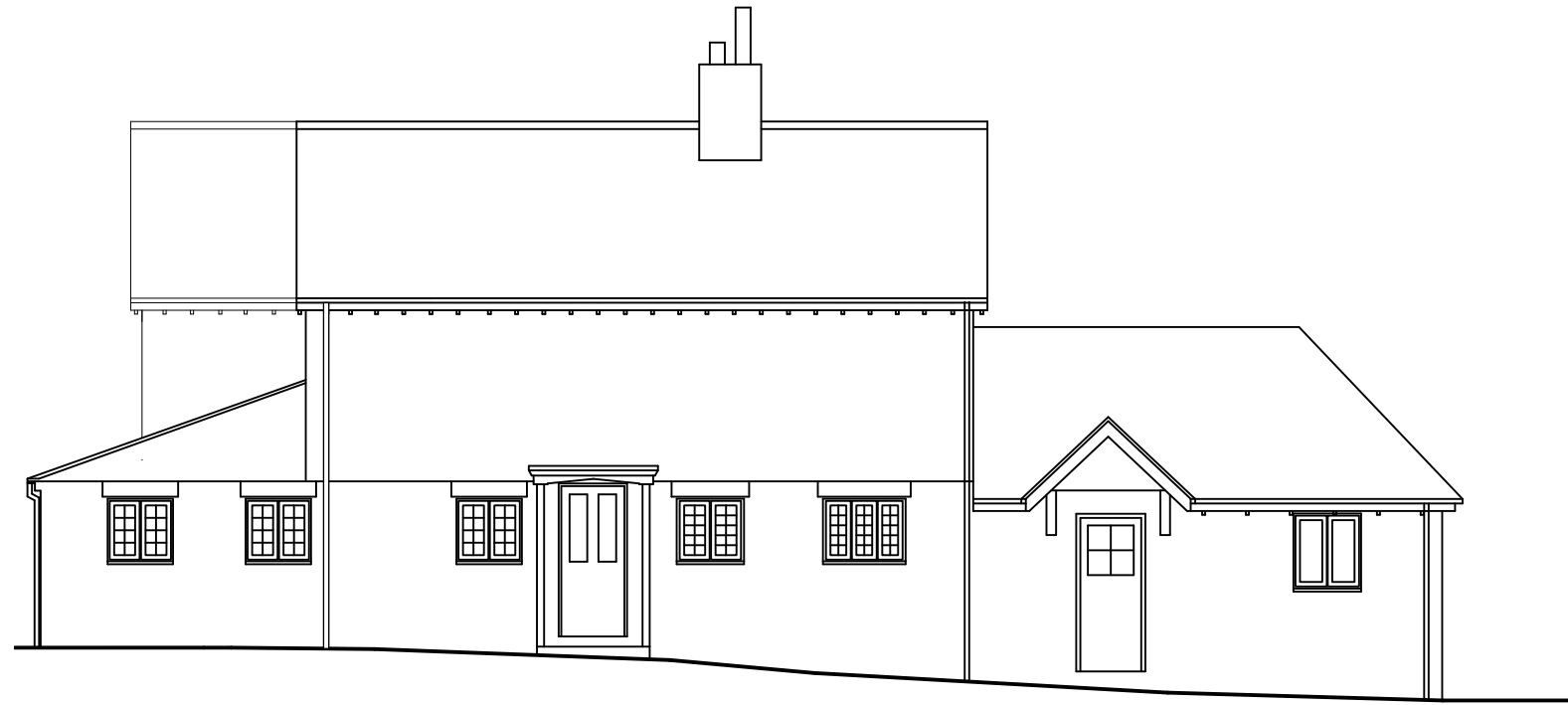
1 Proposed North Elevation Scale: 1:100