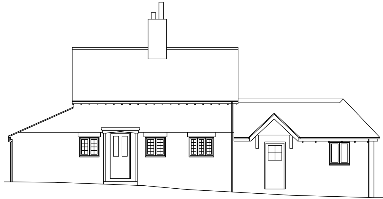
2 Proposed North Elevation Scale: 1:100