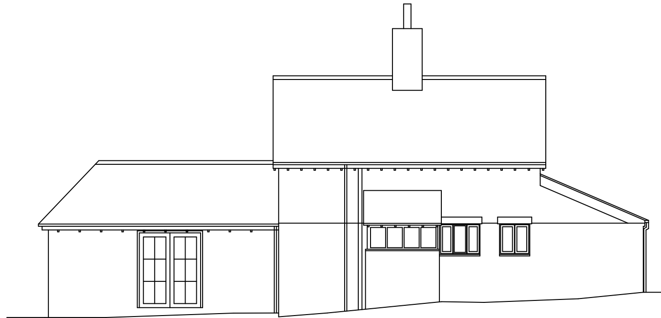
1 Existing South Elevation Scale: 1:100

DRAWING MAYBE SCALED FOR PLANNING DEPT PURPOSES ONLY. OTHERWISE DO NOT SCALE FROM DRAWING. IF IN DOUBT CALL THE ARCHITECT.