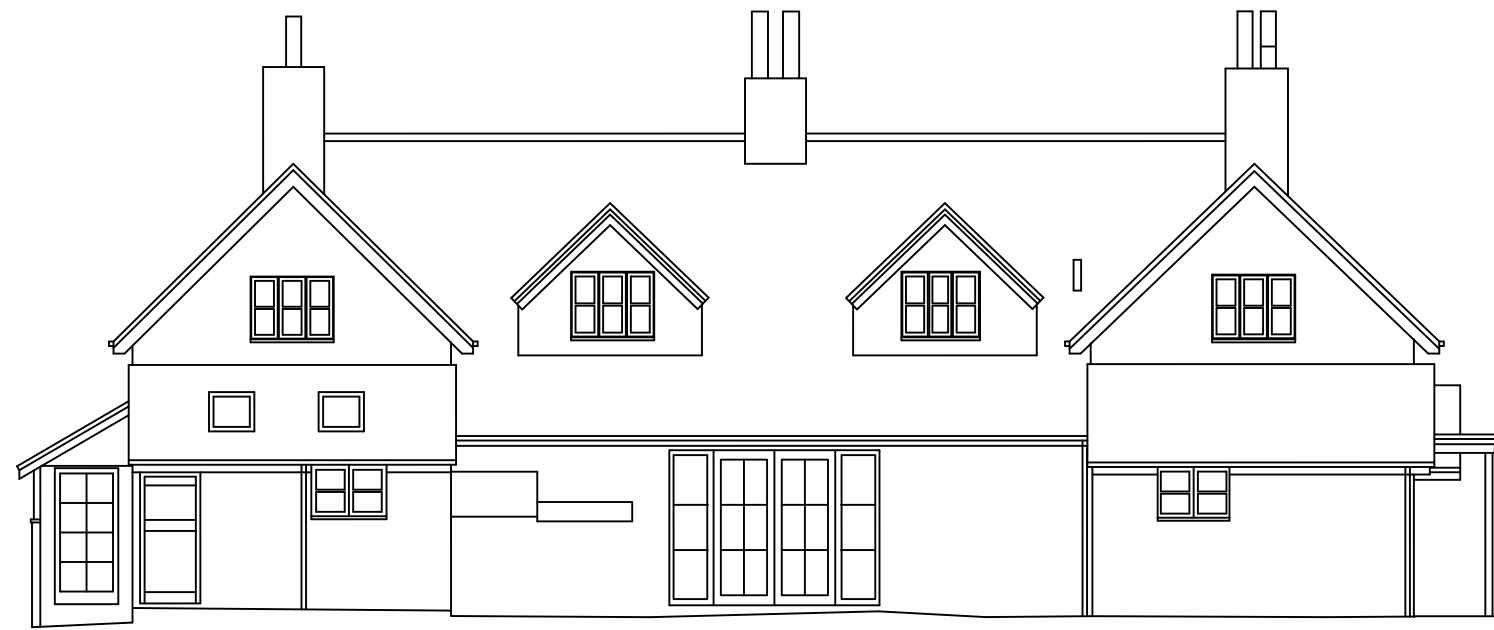
1 Existing East Elevation Scale: 1:100

DRAWING MAYBE SCALED FOR PLANNING DEPT PURPOSES ONLY. OTHERWISE DO NOT SCALE FROM DRAWING. IF IN DOUBT CALL THE ARCHITECT.