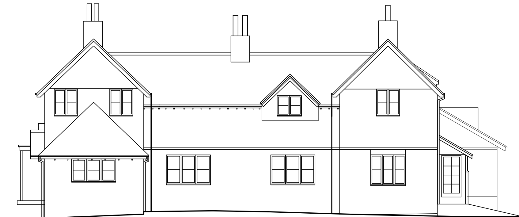
1 Proposed West Elevation Scale: 1:100