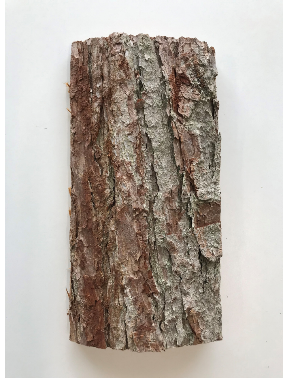
Fig. 1 Sample of proposed replacement timber cladding to Thatch Annex