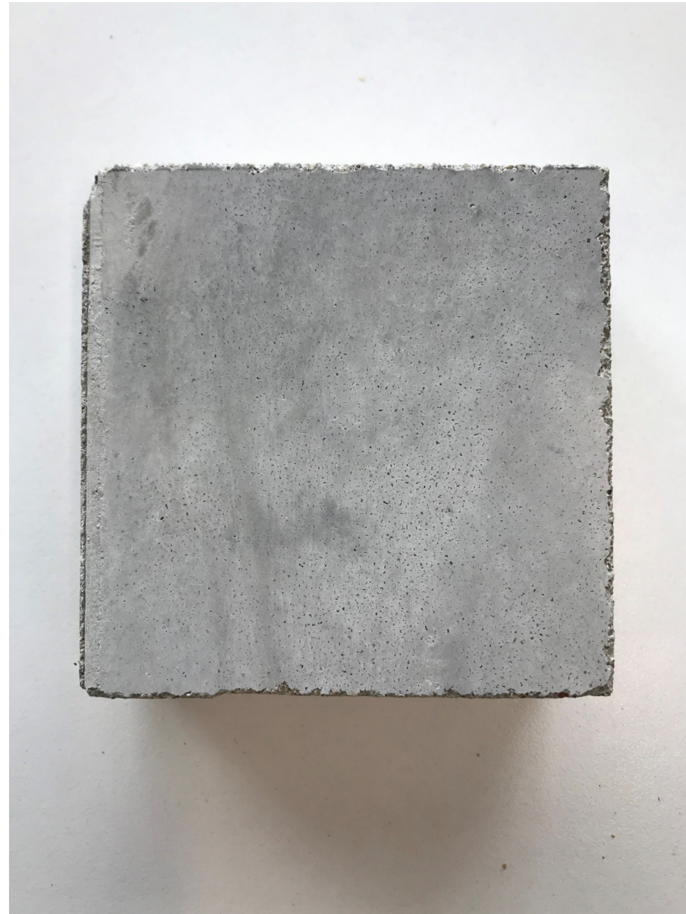
Fig. 3 Sample of proposed Floor finish to Glazed Link

External: Adjustable Recessed LED Uplight