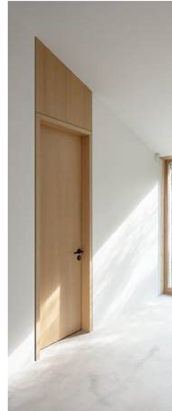
Fig. 7 Matt oiled oak veneer solid core door example image