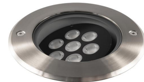
Fig. 5 Adjustable recessed LED uplight