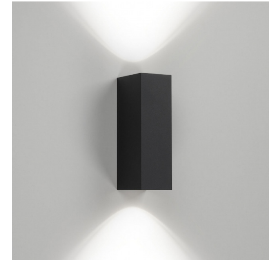
Fig. 4 Delta Wall light (up + down)