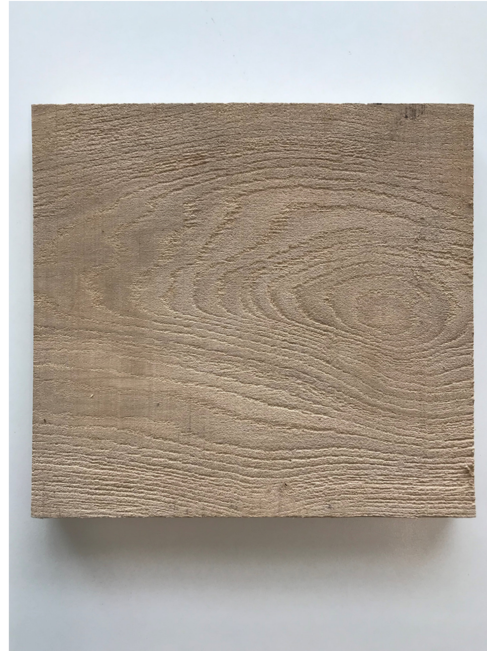
Fig. 2 Sample of proposed new timber cladding to Studio Cottage where required to replace existing boards.