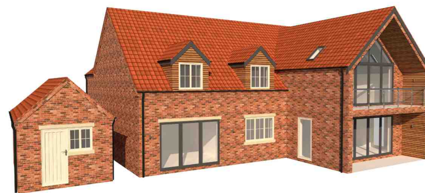
Proposed 3D View From Rear

this drawing is for outline planning purposes and should only be used as a guide