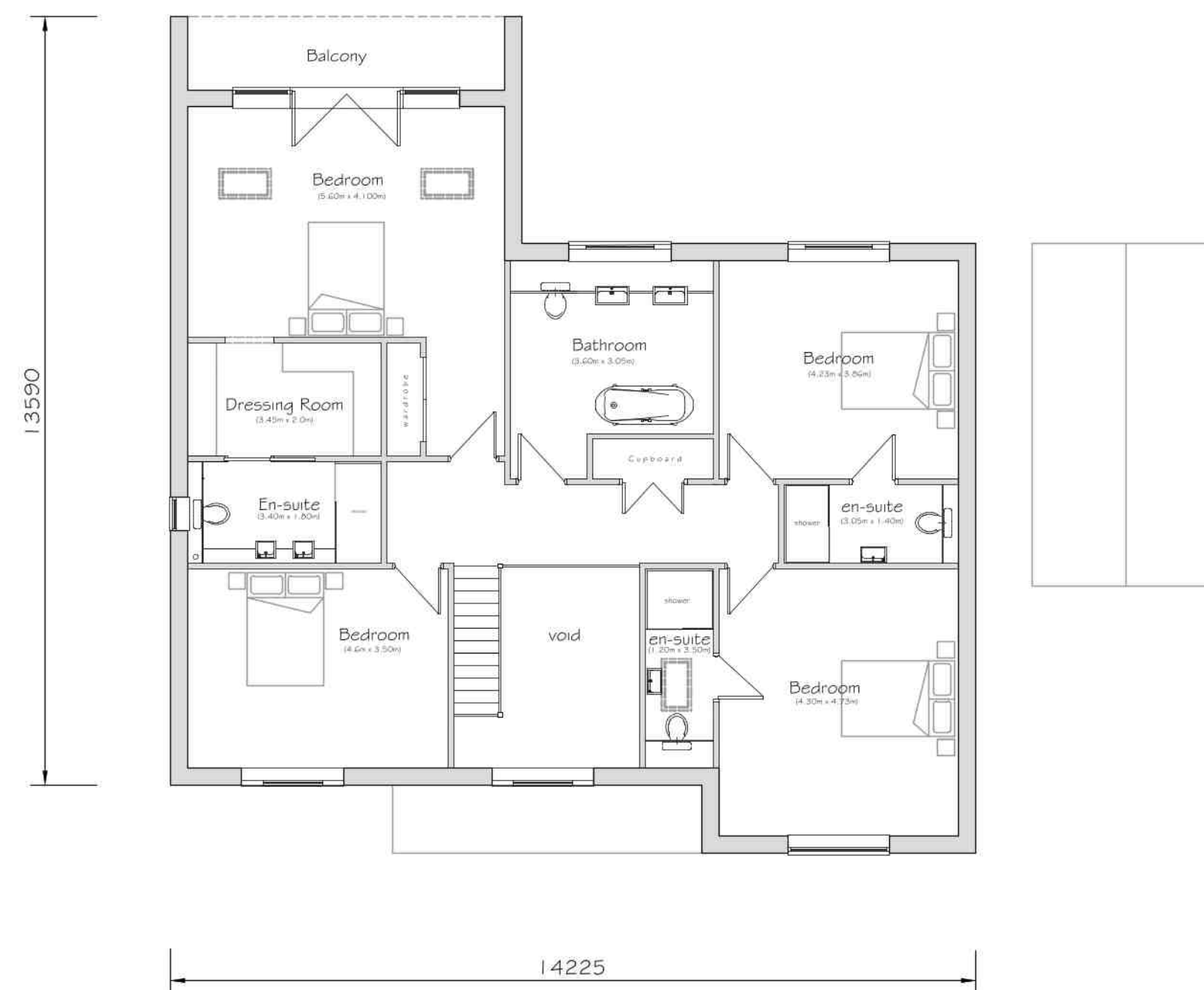
Proposed First Floor Plan (scale 1:100) floor area = 140.0 m 2