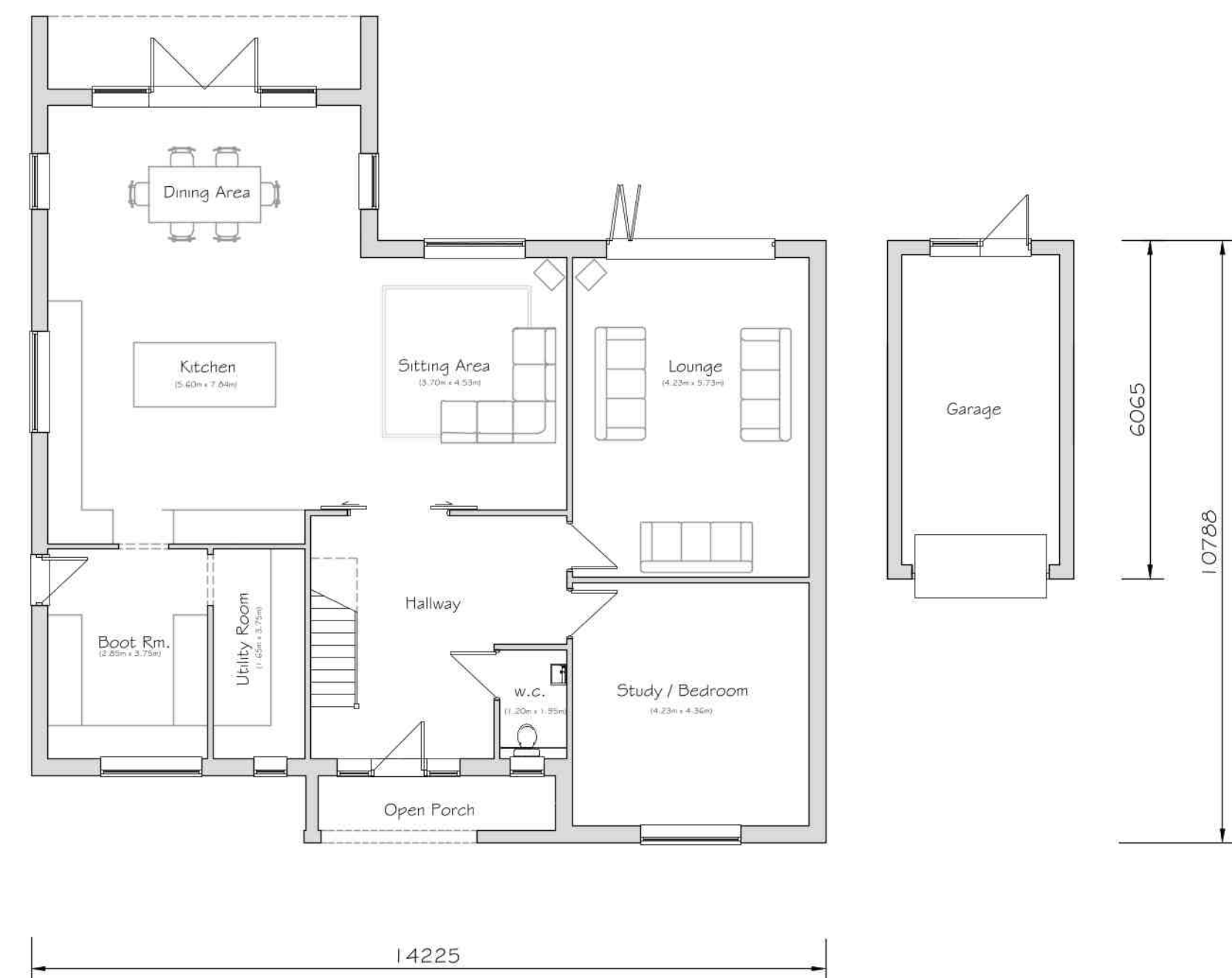
Proposed Ground Floor Plan (scale 1:100) floor area = 140.0 m 2 excl. garage