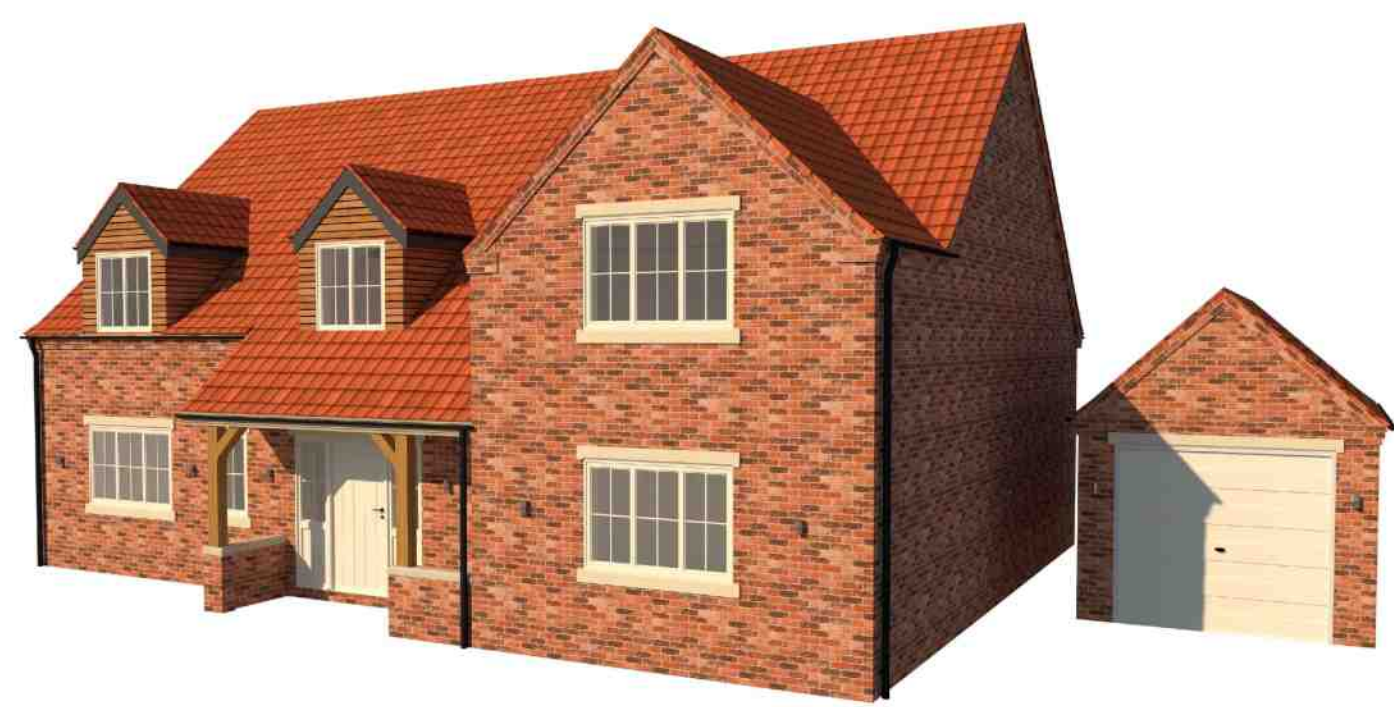
Proposed 3D View From Rear