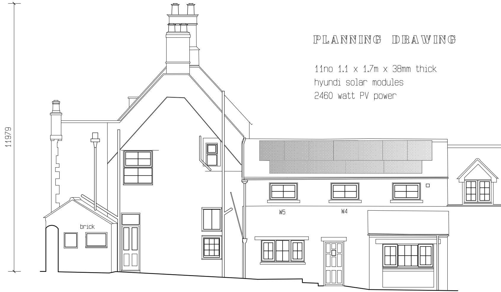
proposed south elevation

11no 1.1 x 1.7m x 38mm thick hyundi solar modules 2460 watt PV power