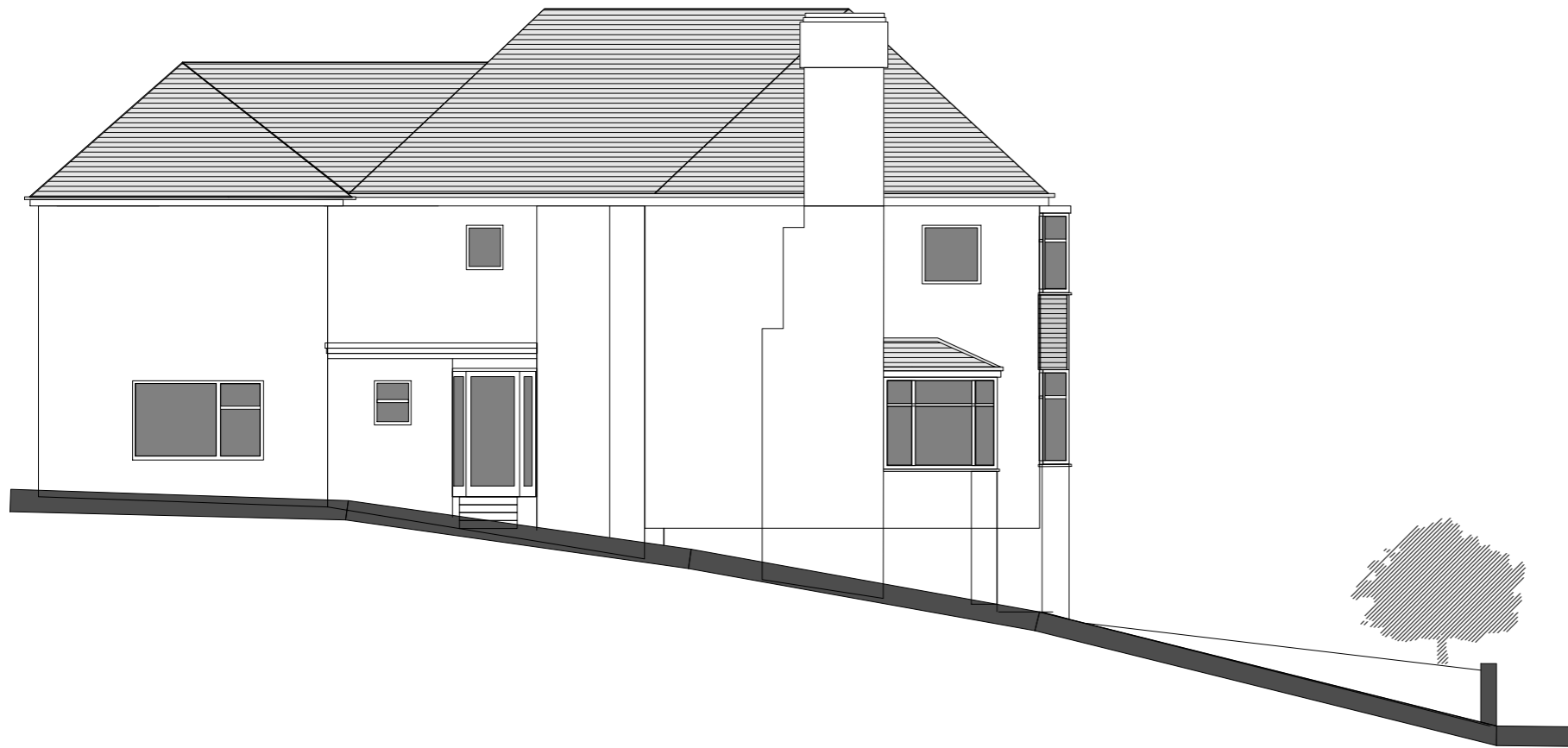
south east elevation