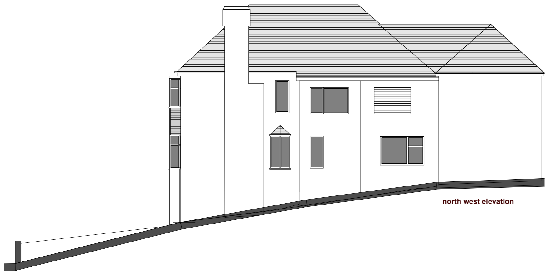
north west elevation

finishes : roof = plain tiles walls = brickwork windows = upvc doors = upvc glass balcony