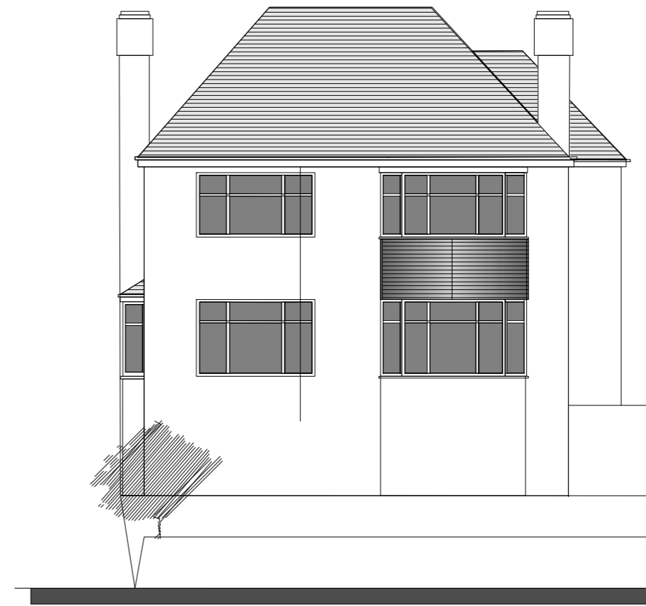
north east elevation

finishes : roof = plain tiles walls = brickwork windows = upvc doors = upvc glass balcony