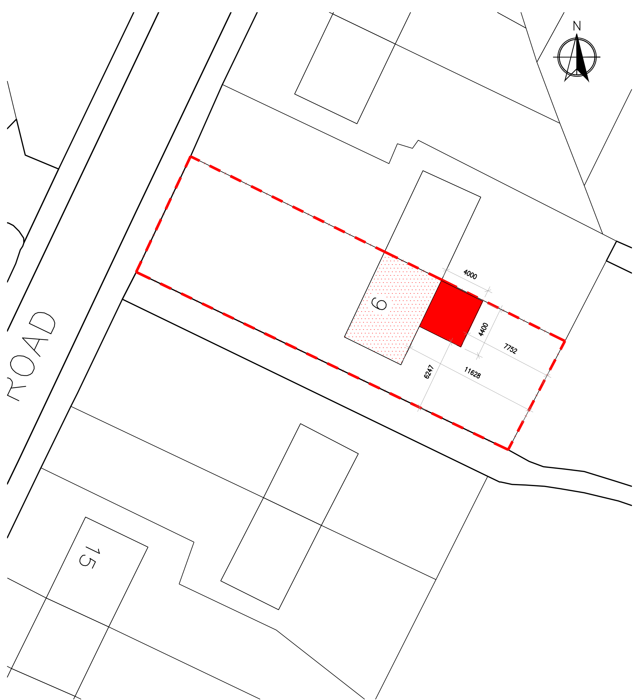
Block / Site Plan (1:200)