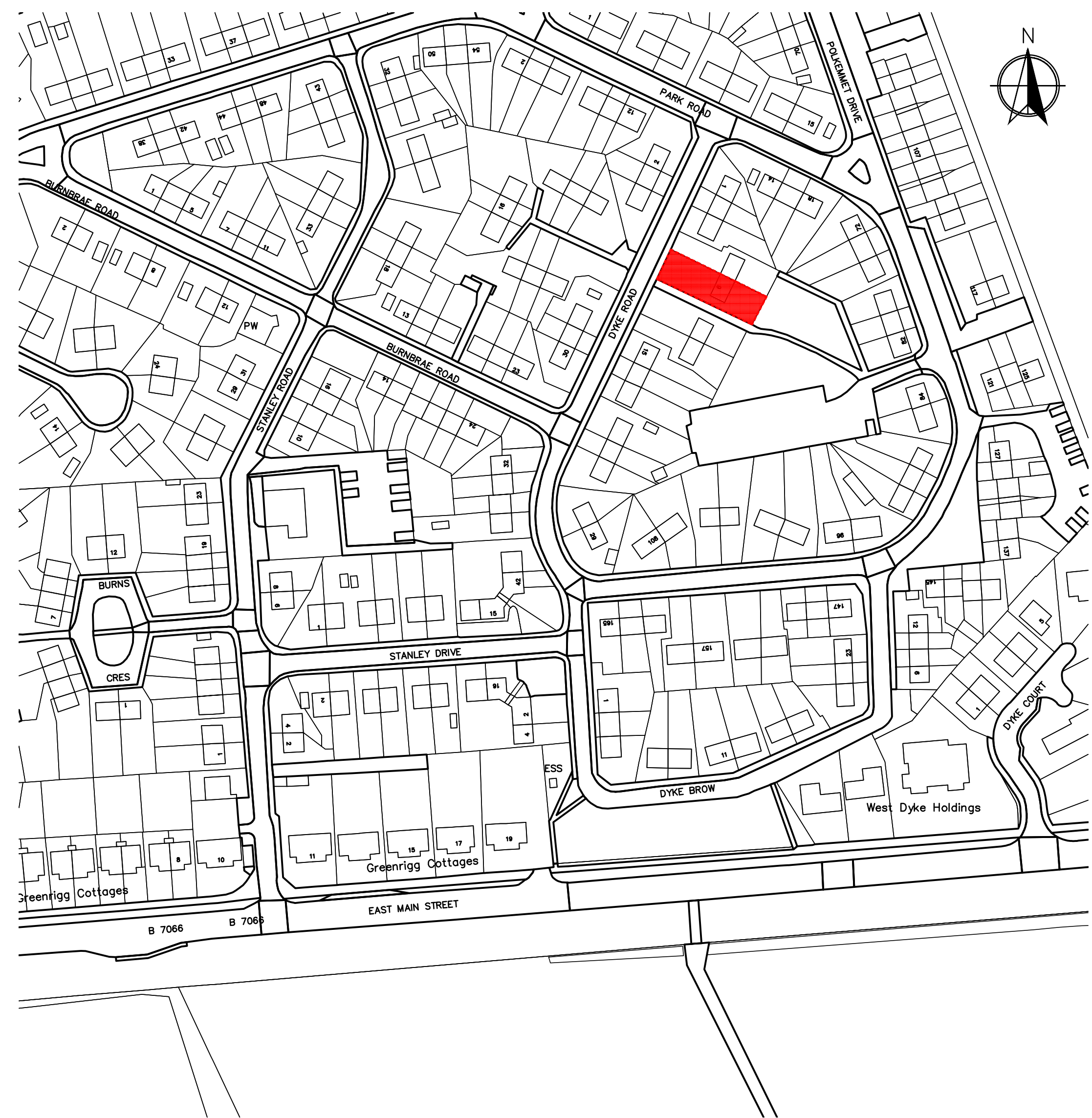
Location Plan (1:1250)