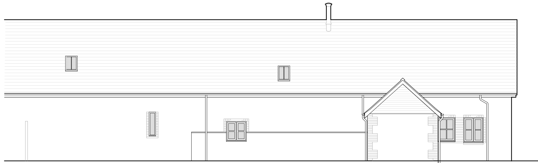
Existing South Elevation

This drawing is the Copyright of Richard Mazillius and may not be altered or reproduced in any way without written permission of Richard Mazillius. Written dimensions supersede scaled dimensions. All dimensions to be checked on site by the Contractor before commencement of the works or before components are fabricated. This drawing is to be used only for the purposes intended and as described in the drawing title box. This drawing to be read in conjunction with all other project drawings, including other appointed Consultant drawings as applicable to the project.