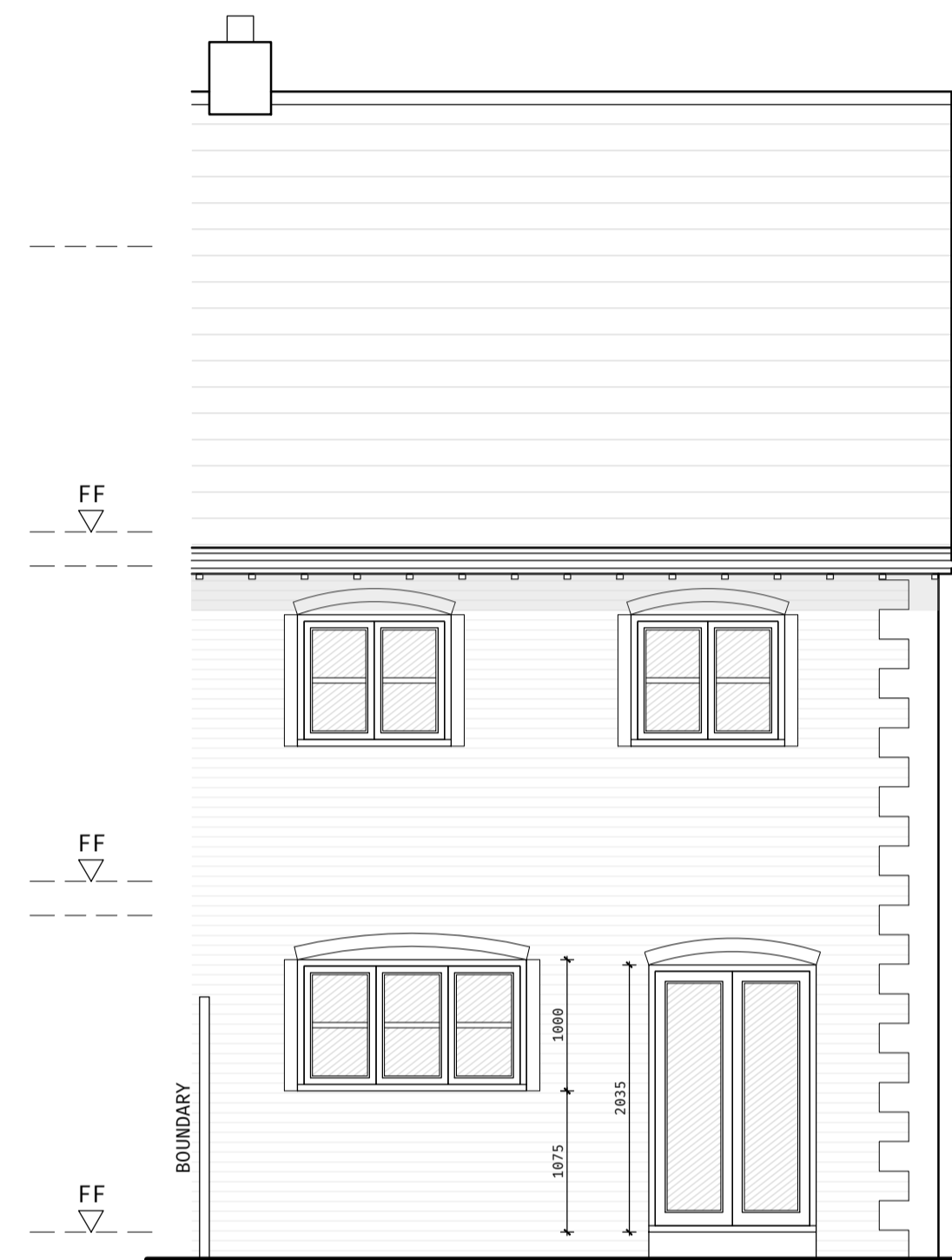
EXISTING REAR (NORTH) ELEVATION