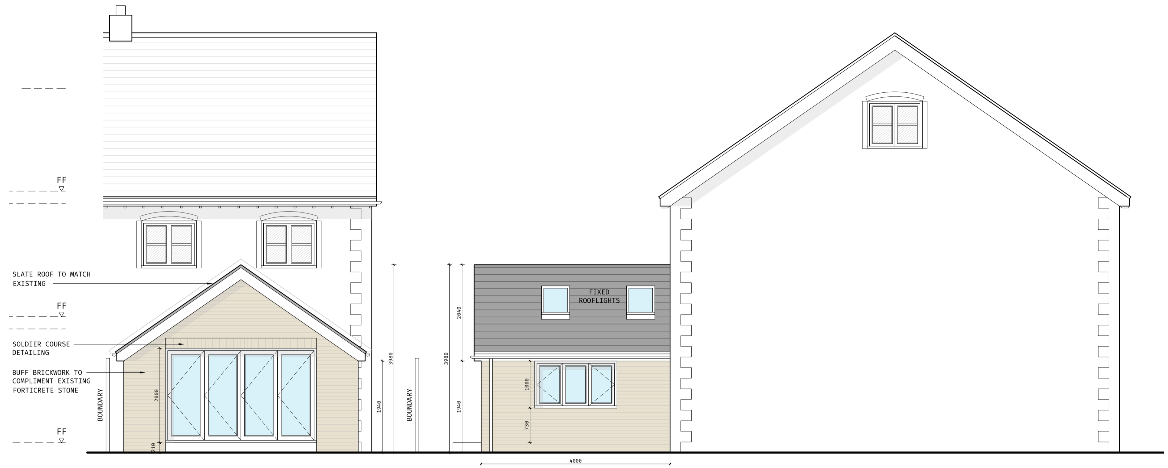
PROPOSED REAR (NORTH) ELEVATION