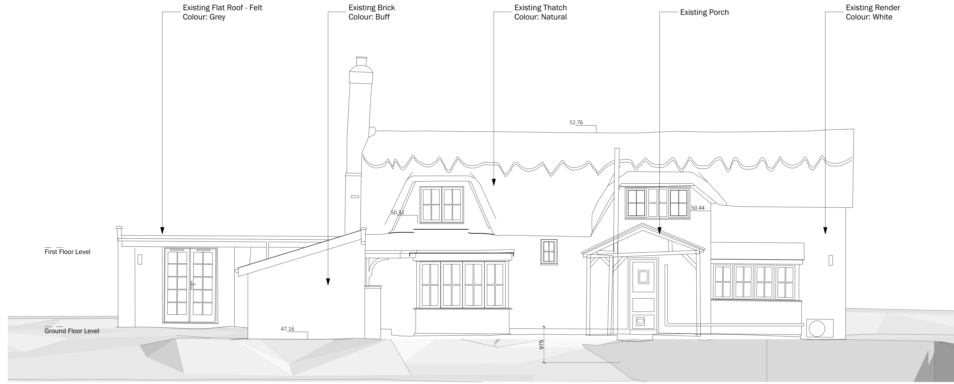
Elevation to South