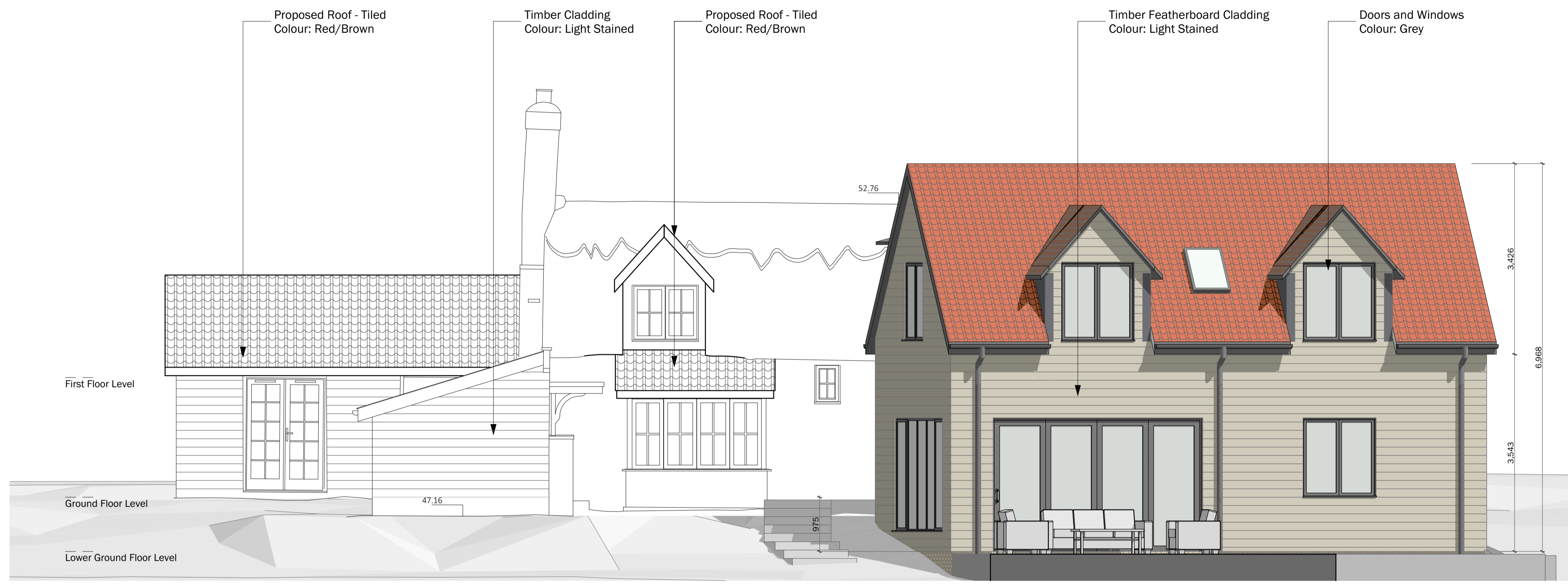
Elevation to South