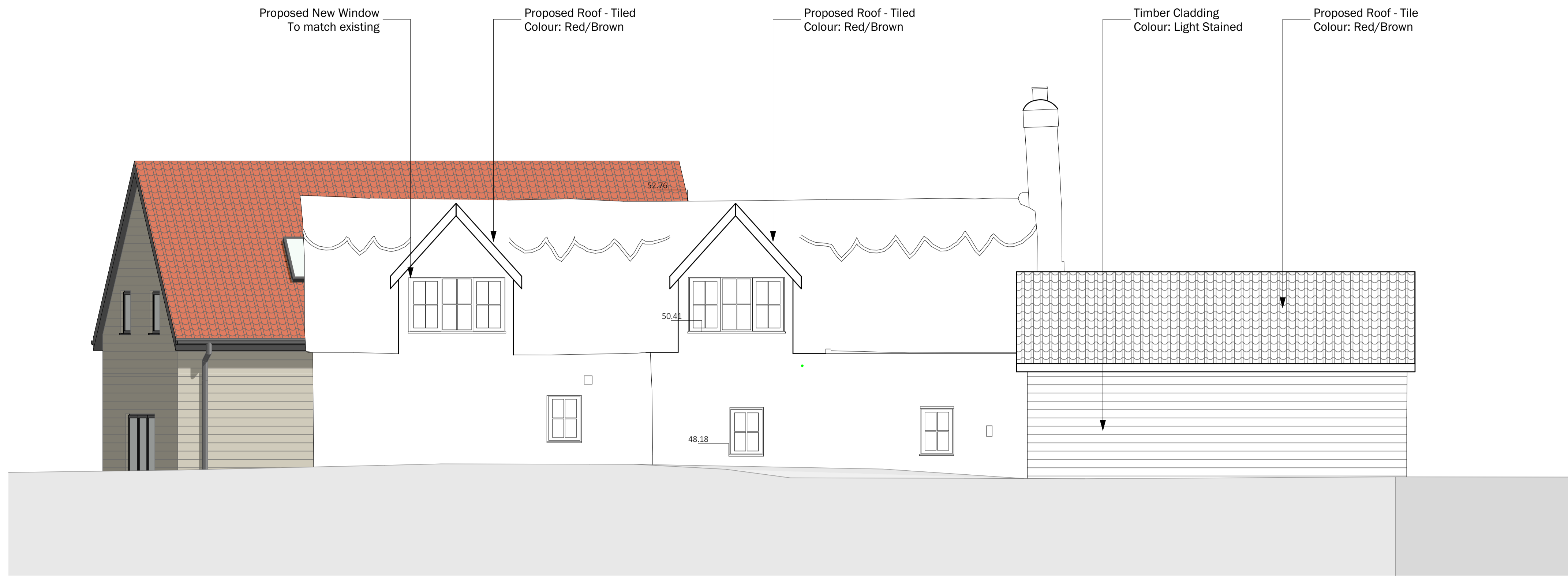
Elevation to North