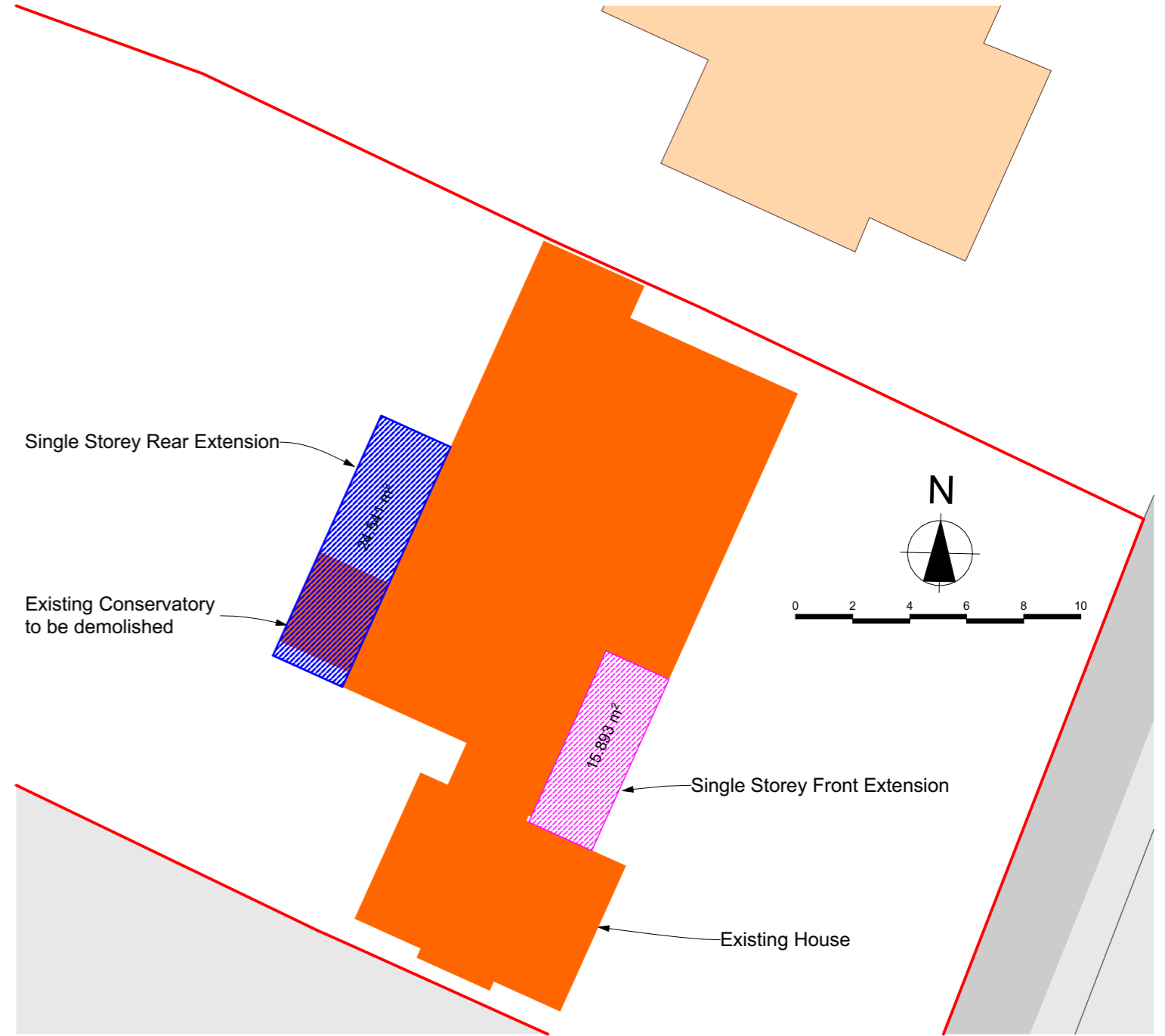
0. Block Plan 1:200