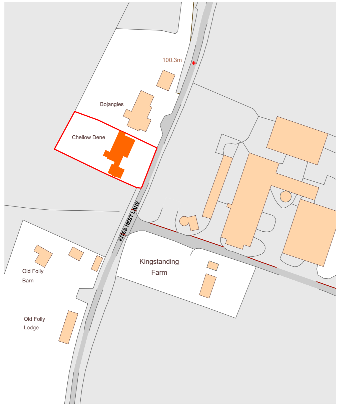
0. Location Plan 1:1250