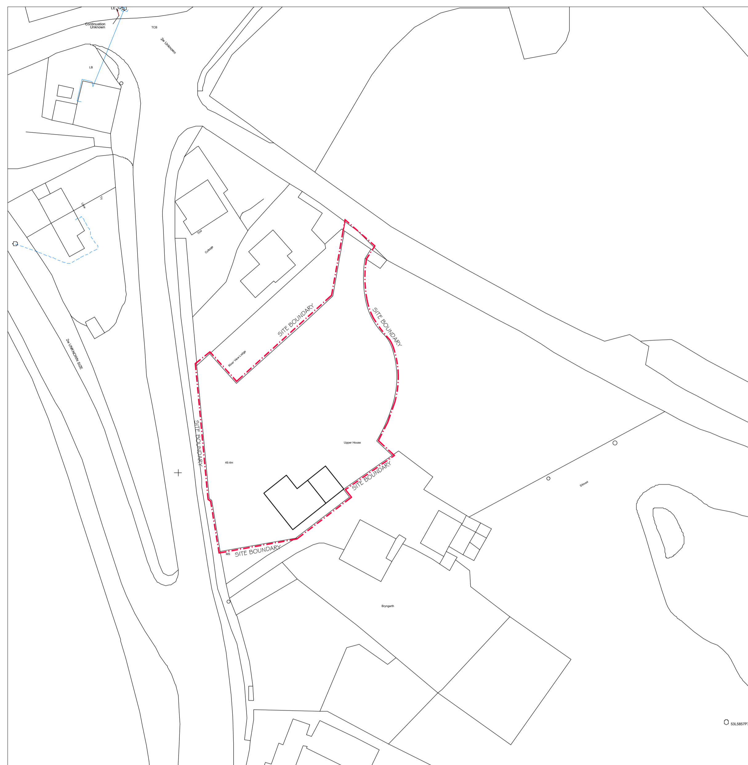
EXISTING BLOCK PLAN SCALE 1:500