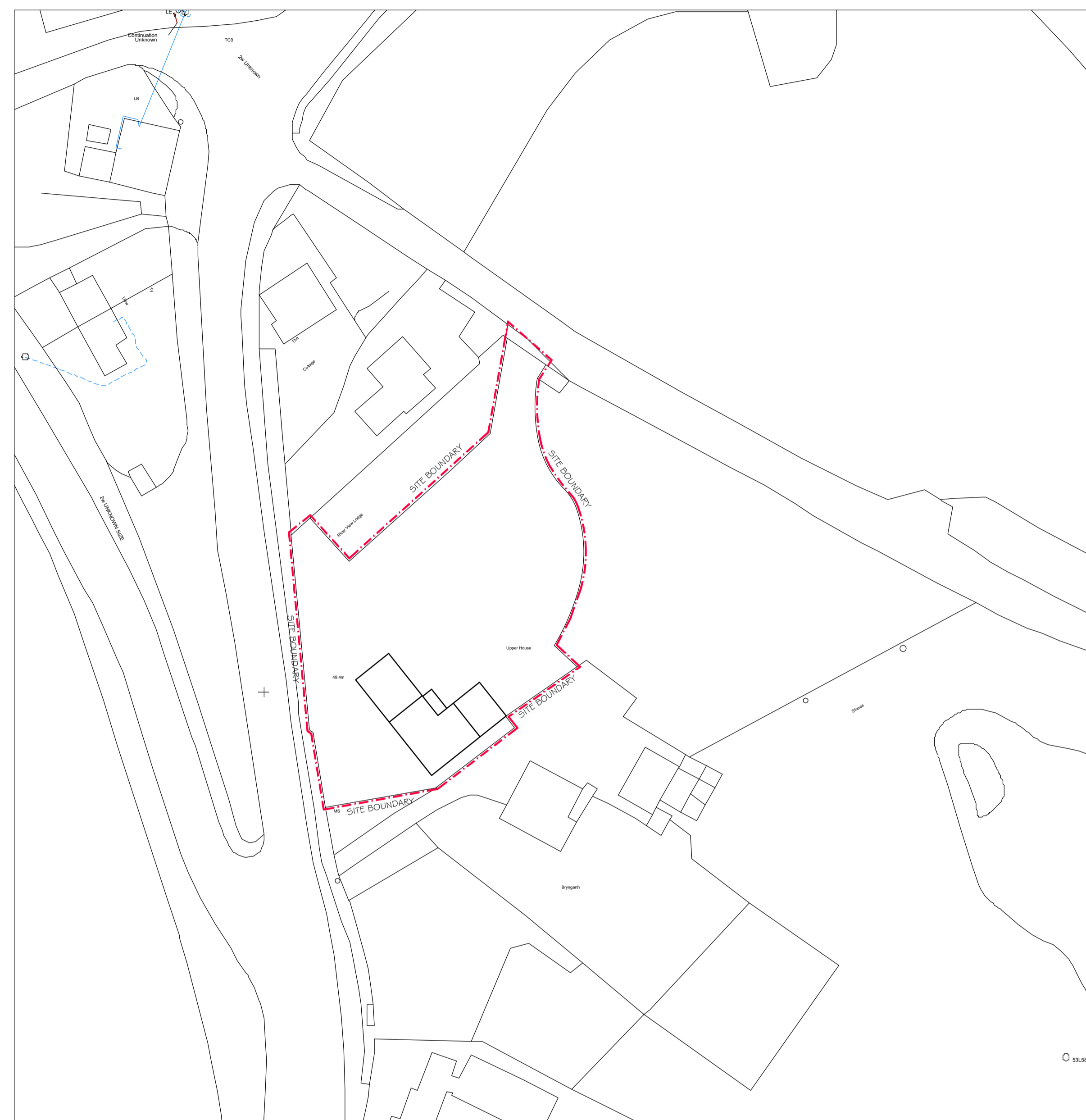
PROPOSED BLOCK PLAN SCALE 1:500