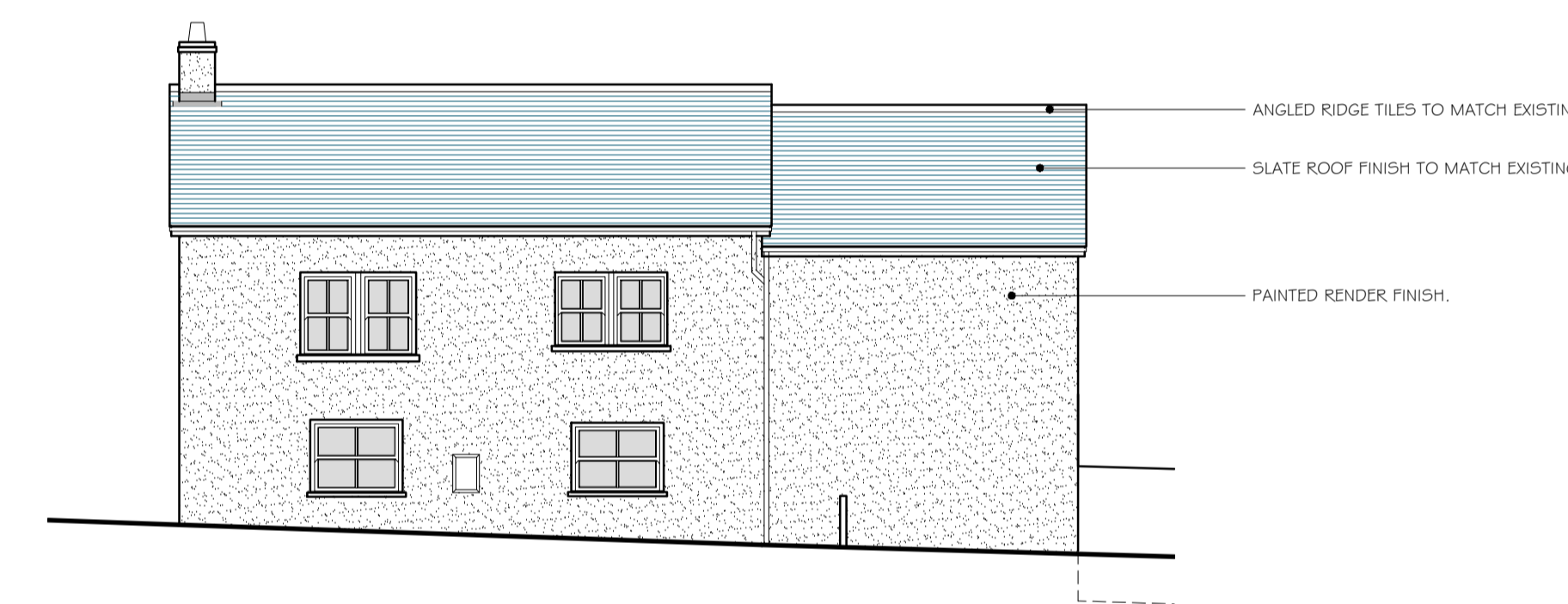
DATUM 7.000 EAST ELEVATION SCALE 1:100