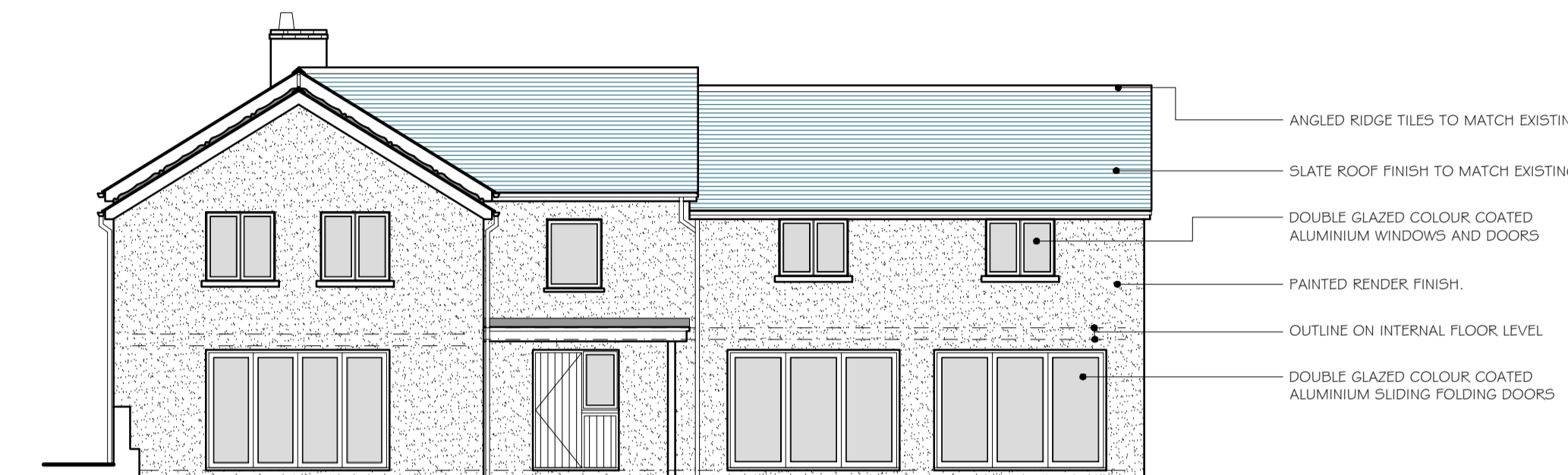
DATUM 7.000 NORTH ELEVATION SCALE 1:100