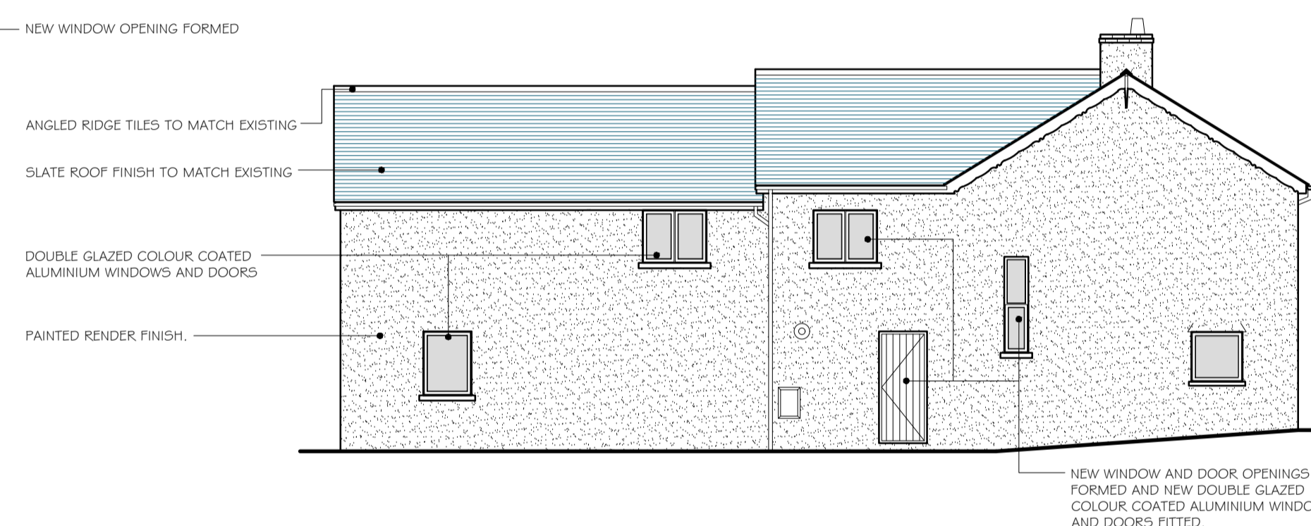
DATUM 7.000 SOUTH ELEVATION SCALE 1:100