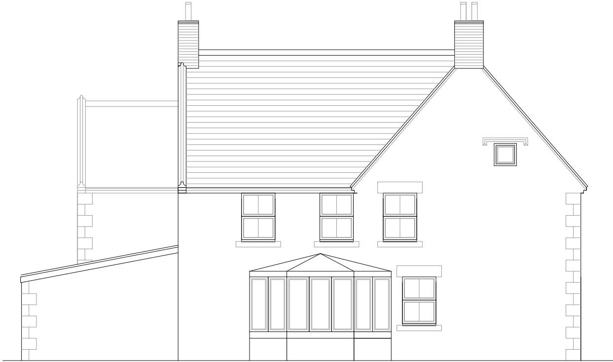
Side 1 Elevation As Existing