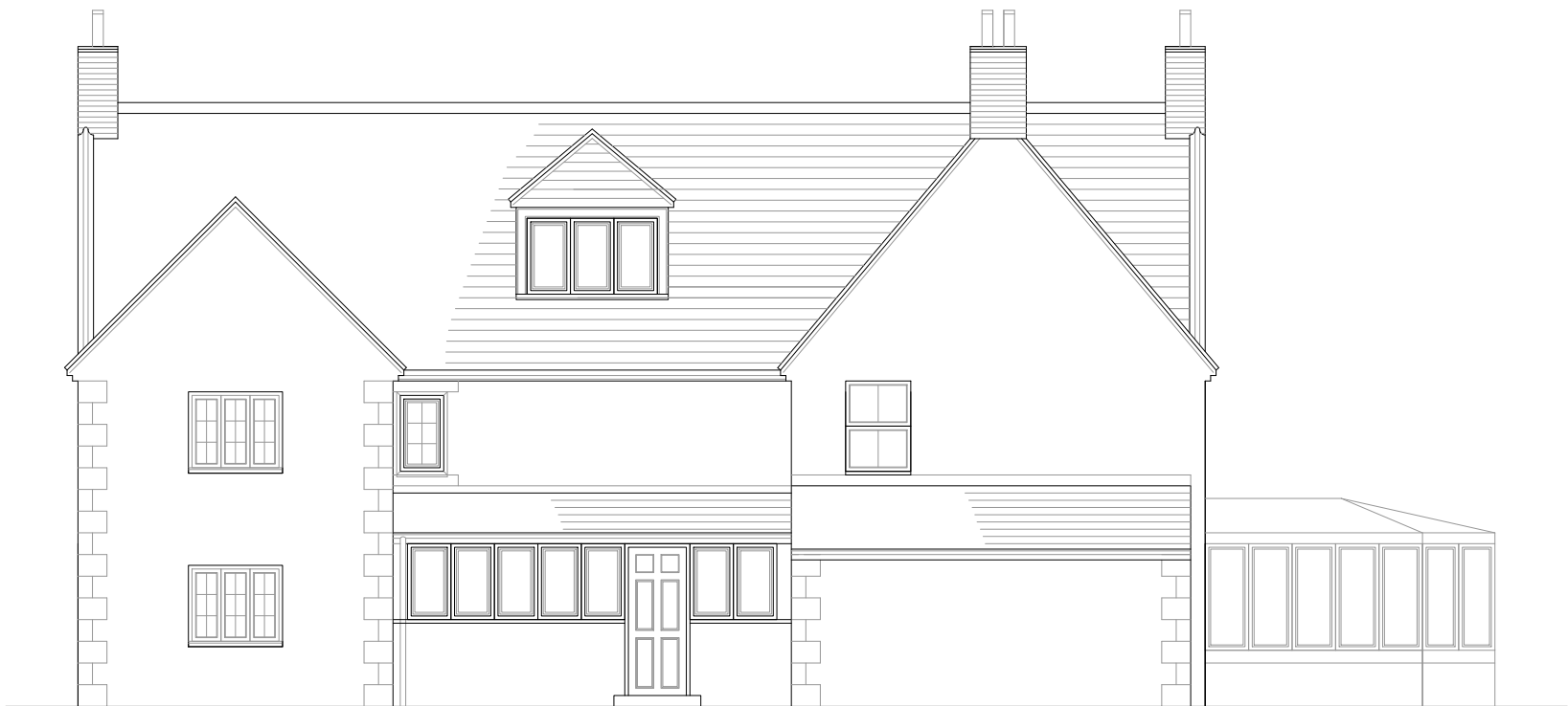
Rear Elevation As Existing