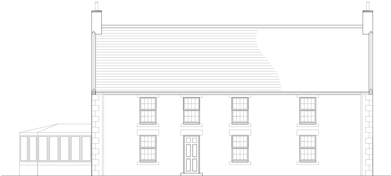
Front Elevation As Existing