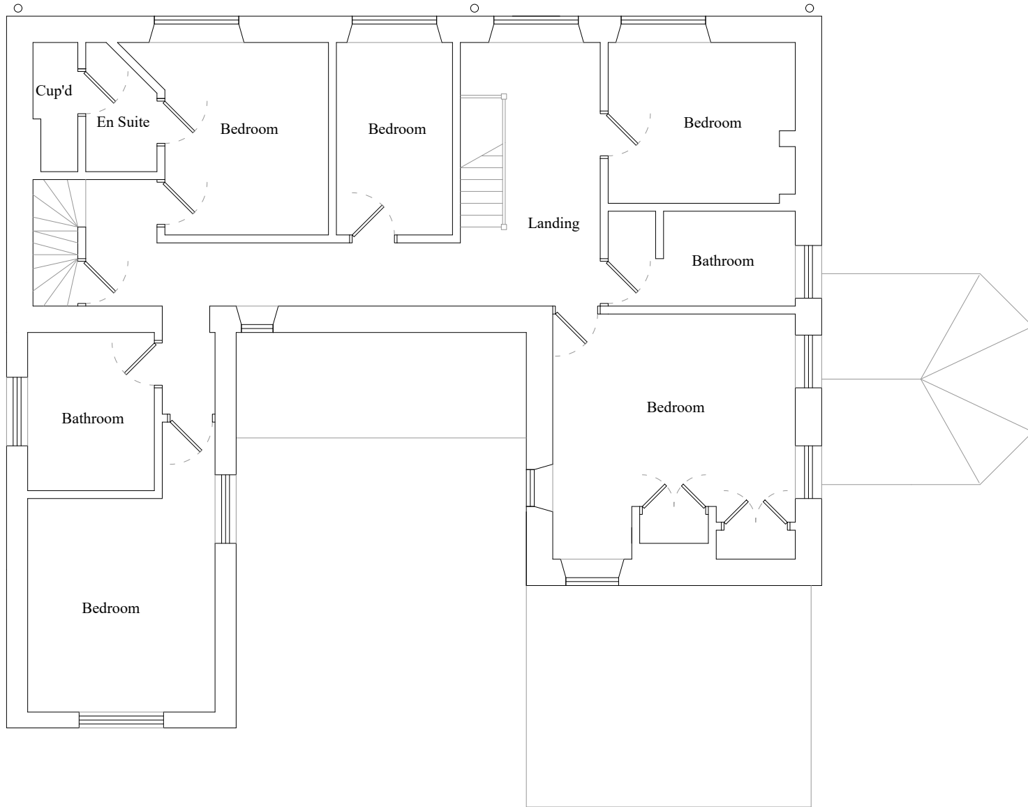
First Floor Plan As Existing