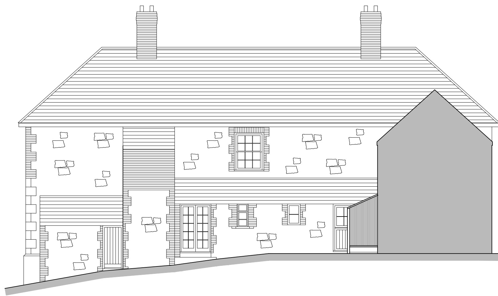
Existing North West Elevation

This drawing is to be read in conjunction with all other relevant Consultants drawings, any discrepancy to be raised prior to commencement.