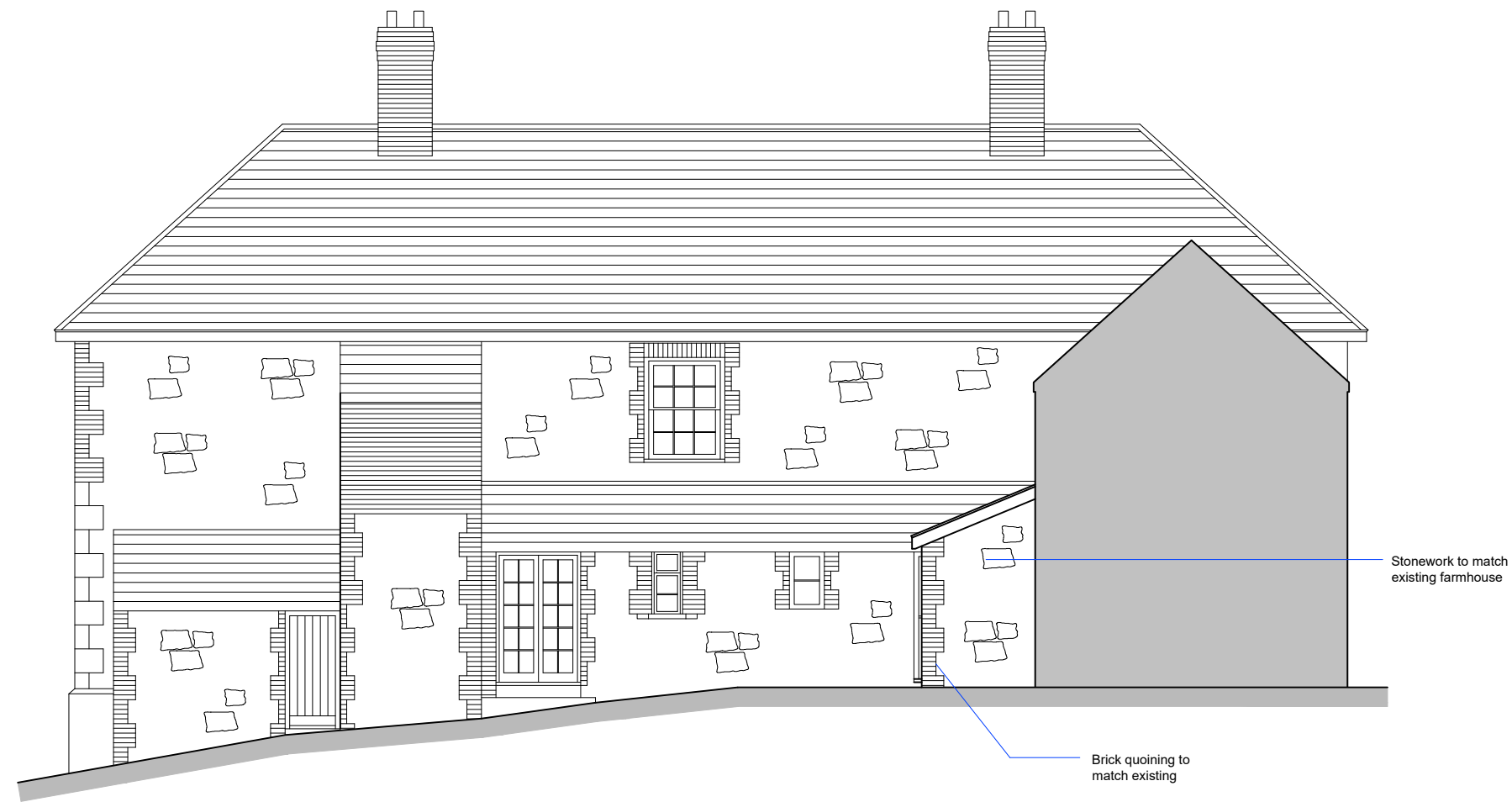
Proposed North West Elevation

This drawing is to be read in conjunction with all other relevant Consultants drawings, any discrepancy to be raised prior to commencement.