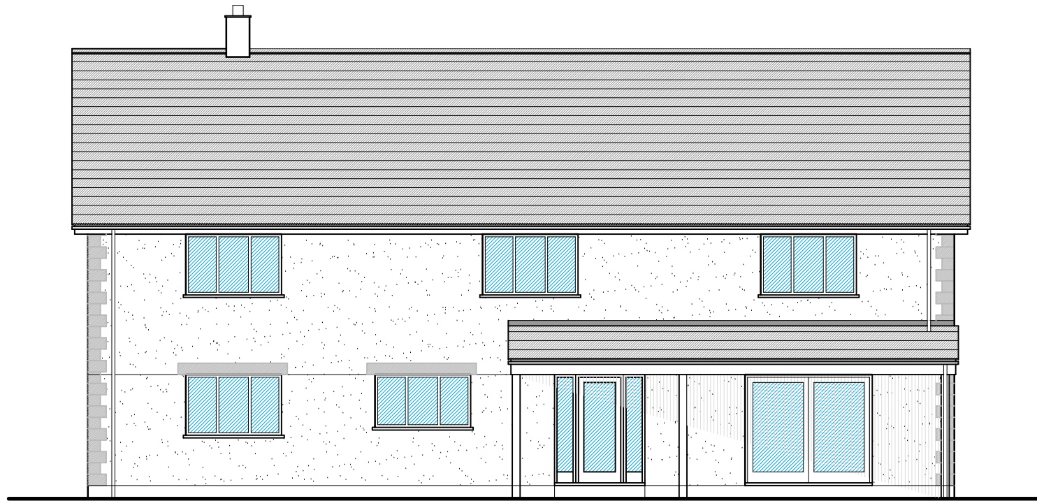
South East Elevation.