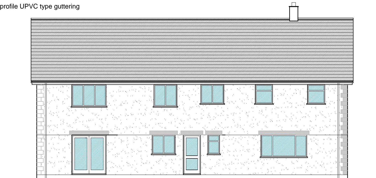
North West Elevation.

Note: This drawing is the sole copyright of Architectural Concepts and may not be used, copied or amended for any purpose whatsoever without prior written approval. Dimensions to be verified on site. Figured dimensions to take preference to those scaled. This drawing is only for the purposes of Town Planning and Building Regulations applications.