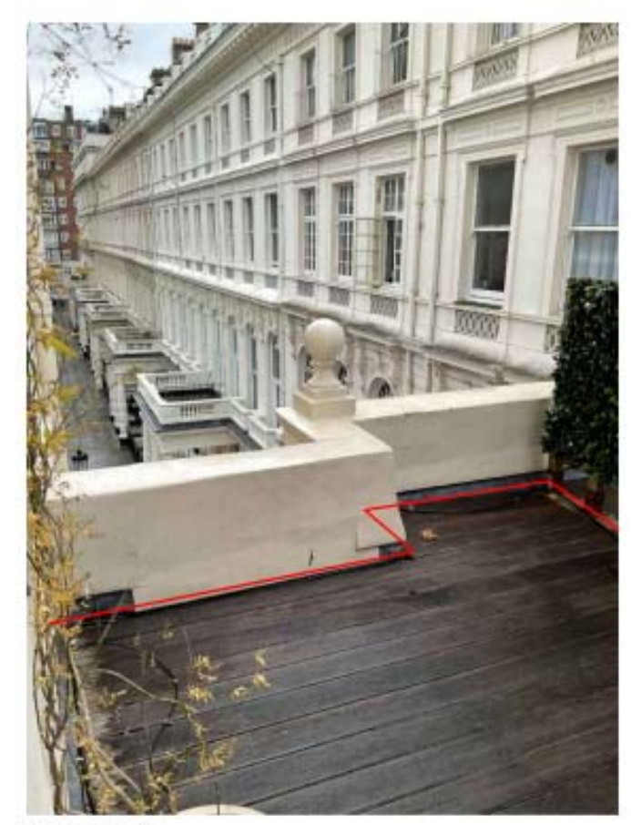
4 FLAT E Terrace