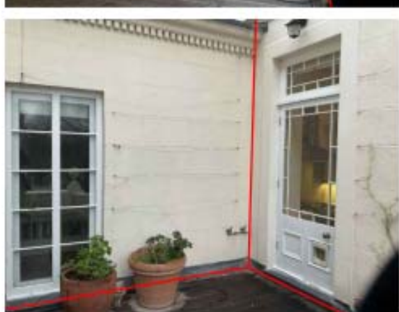
5 FLAT E Terrace