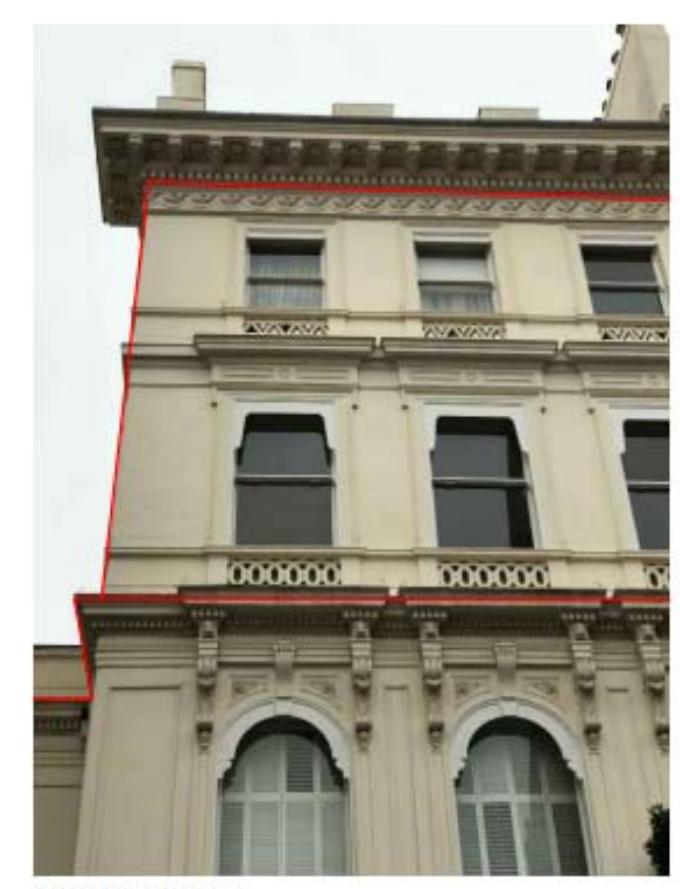
2 FLAT E Front Elevation