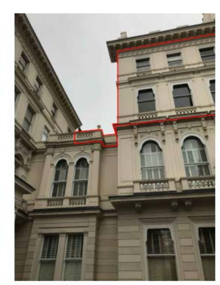
3 FLAT E Front Elevation