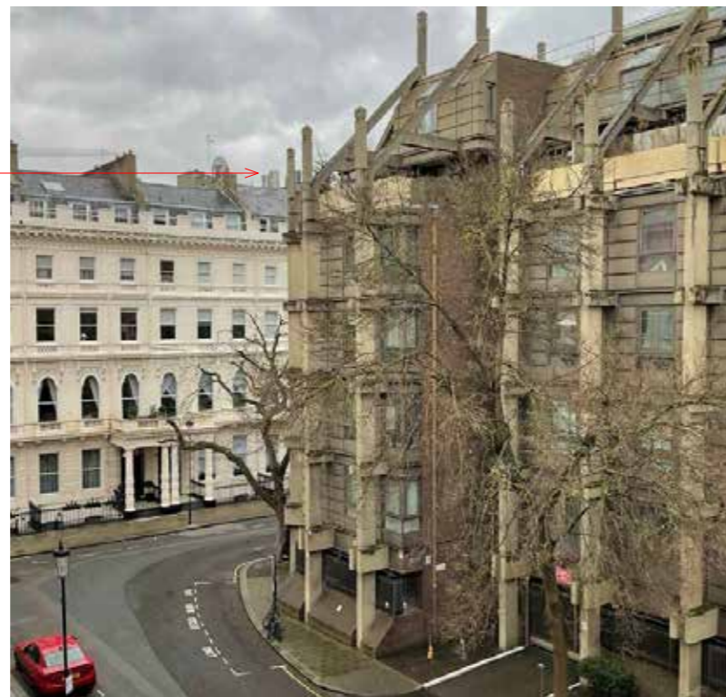
Roof Installation View from Flat E