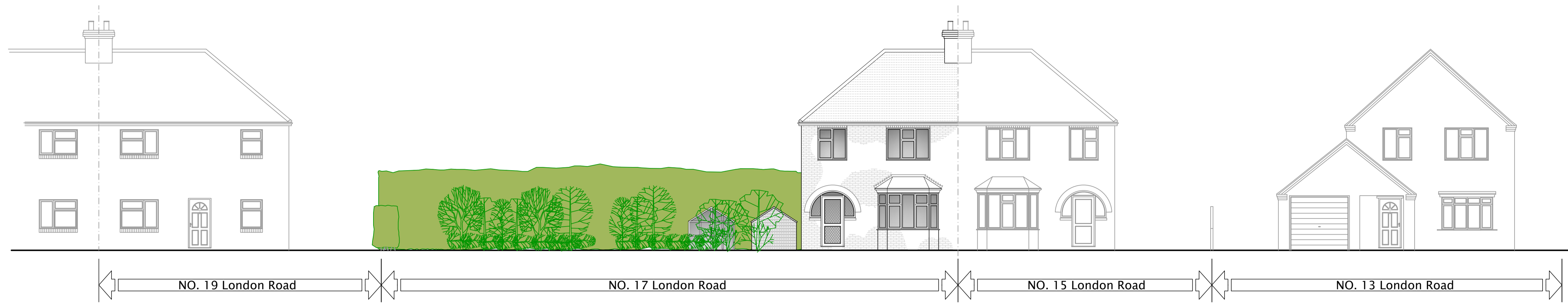
VIEW "A" - 17 London Road - Existing Street Scene - (scale 1:100)