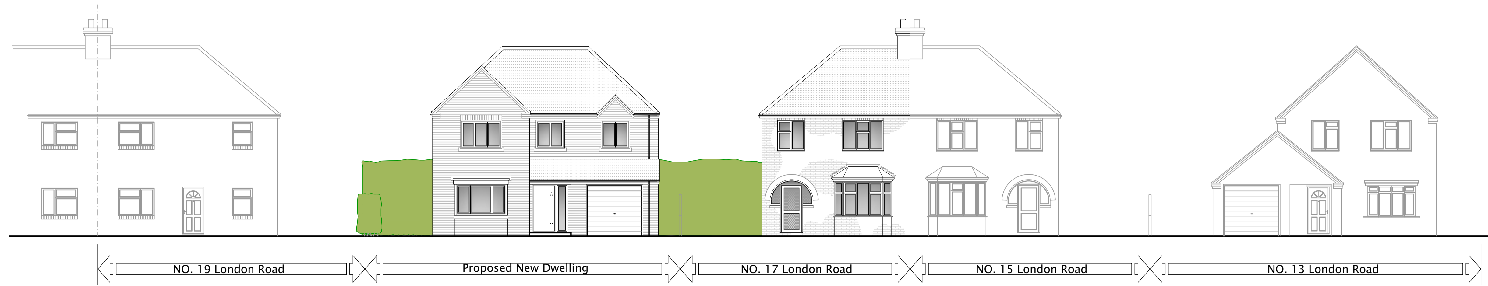
VIEW "B" - 17 London Road - Proposed Street Scene - (scale 1:100)