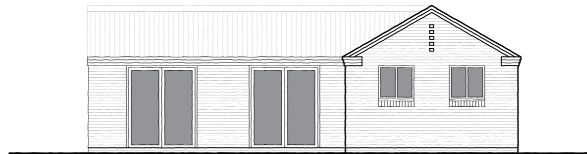
02 - ELEVATION - WEST